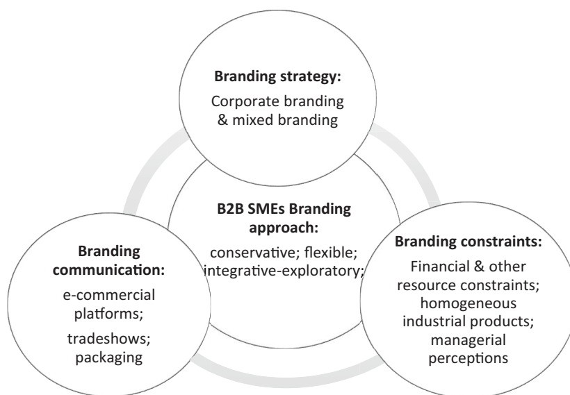
Figure 2. B2B SME branding framework

To guide such effort, it is worth reiterating the finding that corporate brand was the most popular and applicable branding strategy in this B2B study context. This finding echoes earlier studies showing that a corporate brand was a convenient branding strategy to apply, as it presents an overall impression of an organisation (Juntunen et al. , 2010). Our research