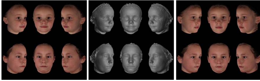
Figure 1. Presentation of the three versions of the stimuli (between subjects), (1) reflectance and shape version (original photograph), (2) shape version (individual shape information retained but surface reflectance information removed) and (3) reflectance version (individual surface reflectance information retained but shape standardized).