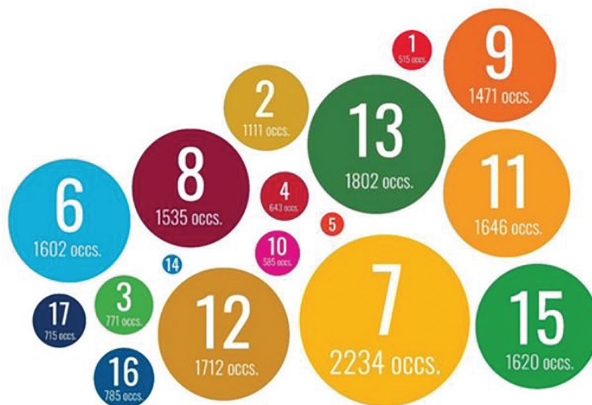
Figure 1. Occurrences of 2030 agenda goals-related keywords in all selected papers [25].

Many researchers have shown the benefits of using artificial intelligence (AI) technologies for achieving the SDGs (see, for example, [33–36]). Similarly, deep learning techniques also have an impact towards achieving the SDGs (see, for example, [37–39]). Blockchain technology can also contribute to the SDGs, in particular, to enhance the environmental sustainability [40] and to transform governance and sustainability in integrated food supply chains [41].