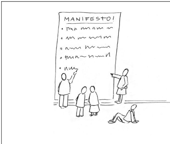
Illustration 2: Creating a Manifesto