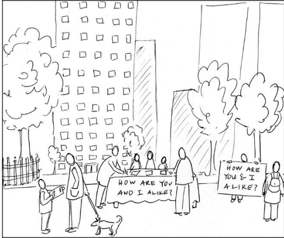
Illustration 3: Working with the Community