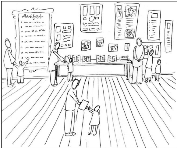
Illustration 4: The Public Exhibition