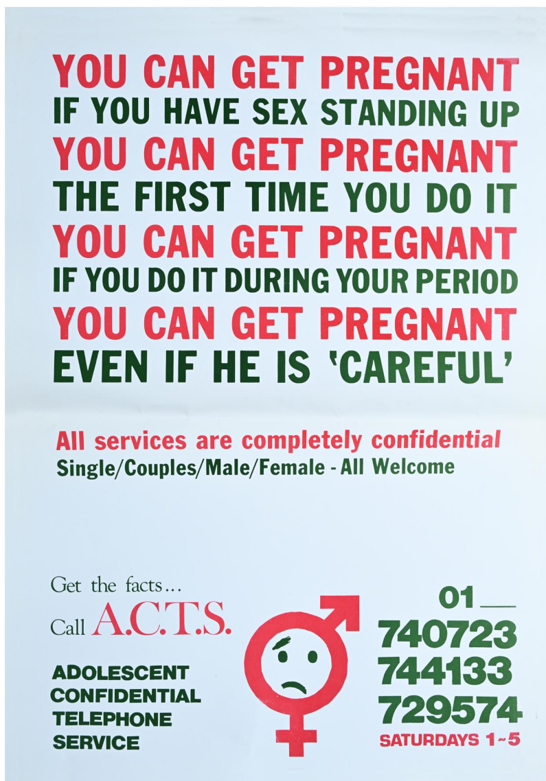
Figure 2. ACTS poster, 1986. Irish Family Planning Association archive, RCPI Heritage Centre, Dublin. With thanks to Harriet Wheelock.

79% of callers in 1986, 74.8% of callers in 1987, 87% in 1988, and 85% in 1989. 87 There are a number of possible explanations for this pattern. It could suggest that young men were active agents in seeking information around sexual and reproductive health, or that young men were particularly affected by the country's sexually repressive environment and lack of information. Alternatively, the logbook entries might indicate that it was often men who