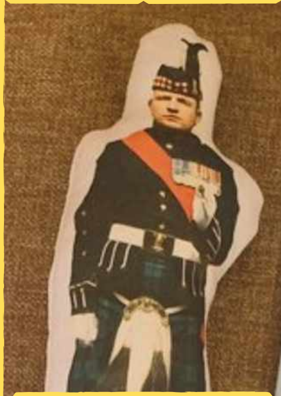
Two 'Deployment Dolls'