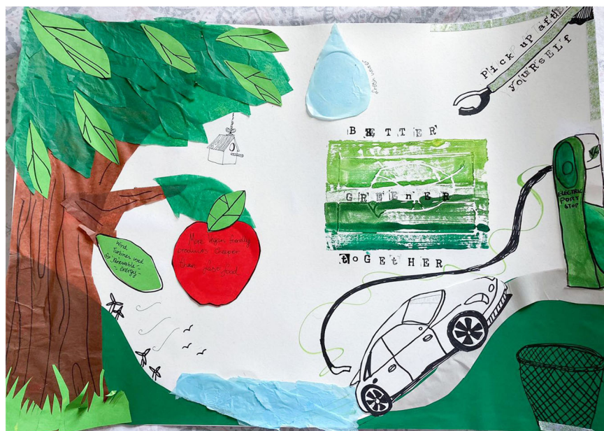
FIGURE 2 Poster collage featuring: a tree collage with text on a leaf 'Wind turbines used for renewable energy', an apple with text 'More vegan friendly products cheaper than fast food' and a bird house; a hill with wind turbines and birds flying; a body of light blue water and a large raindrop labelled 'fresh water'; an electric car, charging station and an empty rubbish bin; a litter-picking tool with text 'Pick up after yourself'; printing of a leaf with text 'BETTER, GREENER, TOGETHER' (Glasgow 3, she/her, 19).

Several participants extended their discussions of natural environments beyond benefits to individuals or communities to focus on sustainability and planetary health. One participant made this a central theme in her final artwork (Figure 2).