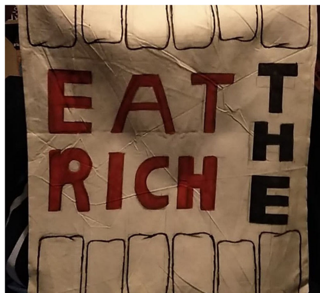
FIGURE 4 Tote bag featuring: line drawing of top and bottom teeth; 'EAT THE RICH' in bold black and red letters in the centre (Glasgow 1, she/her, 17).

Young people's visions of economic futures broadly focused on three main areas: employment and the labour market, pay and welfare/universal basic income (UBI), with concerns around addressing injustices and protecting people's mental health evident across each.