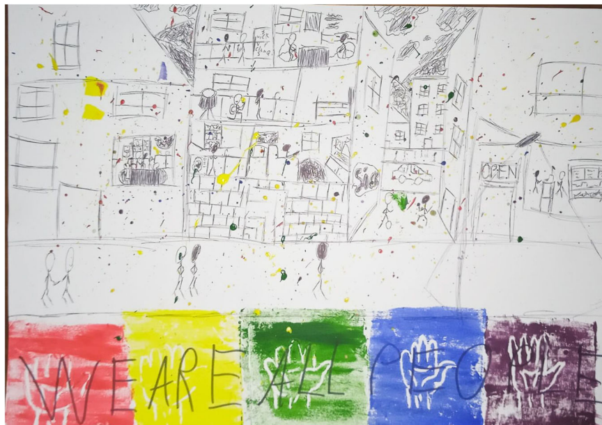
FIGURE 3 Poster featuring: line drawing a cross-section of a street; stick figures walking and playing a game outside, and cooking, eating and standing at a bar with an 'open' sign inside; repeat hand print in rainbow colours with the words 'WE ARE ALL PEOPLE'; colourful paint splatter (Glasgow 3, he/him, 18).

The artist reflected on how unity is featured in his artwork: