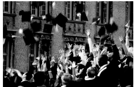
There are significant social inequalities among UK graduates.

Research on social mobility has shown that this social advantage cannot be fully explained by differences in educational attainment. Children with more educated parents or parents in professional jobs are more likely to get better jobs than children from less advantaged families who achieved the same levels of education. Focusing on higher education graduates, our study