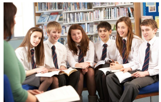
Social inequalities in entry to Higher Education are mostly explained by subject choice in Scotland.

Scotland and Ireland are similar in that they have comparable levels of social inequalities in education. Both countries have also seen expansion in the number of school pupils going into HE. However, Ireland and Scotland differ in the requirements for graduating from secondary education and entering HE. Unlike many European countries, Scotland