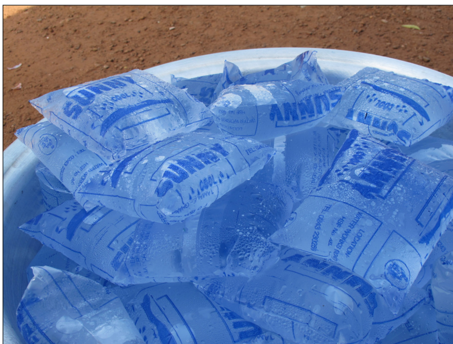
Figure 2: Pure Water Sachets.