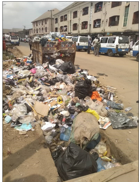
Figure 3: Wastes dumped inside a gutter near the University.

Lawrence, an environmental student specifically mentioned the physical environment as playing a role in compounding the problem because the high rainfall, clay soil, and 'sloppy' terrain (a common feature of Eastern Nigeria) encourages erosion, which facilitates the flow of plastics down towards the University