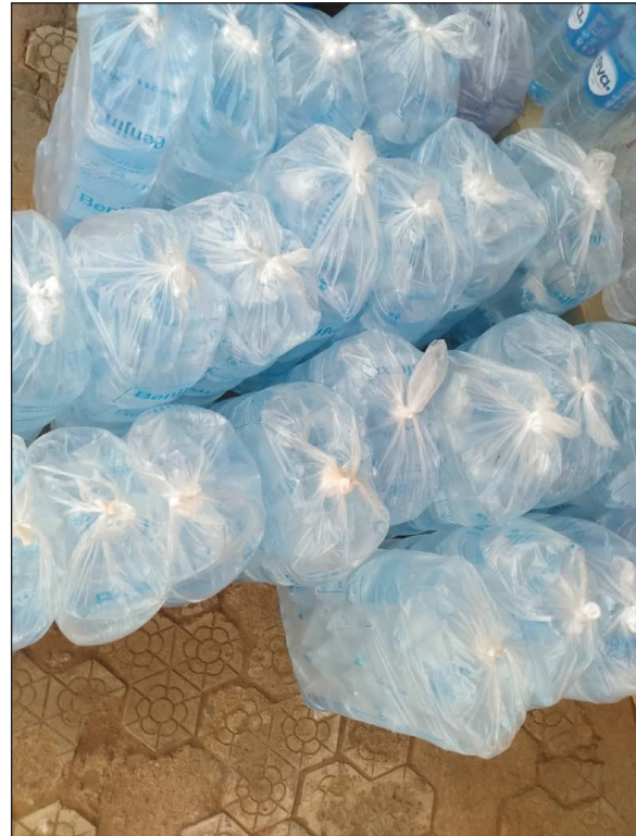
Figure 1: Pure Water Sachets.

sources, nor do producers subject the water to requisite treatment before packaging (Nnaji, Eluwa & Nwoji 2013). Over 70 percent of Nigerians consume at least one bag of plastic sachet water each day (Edoga, Onyeji & Oguntosin 2008) generating around 60 million plastic sachets. Although most people would prefer bottled water, the cost for a household would be around ₦47,700 (around 110 euro) per month, which is prohibitively expensive given the average monthly income is ₦35,000, (around 80 euro) (Nnaji, Eluwa & Nwoji 2013).