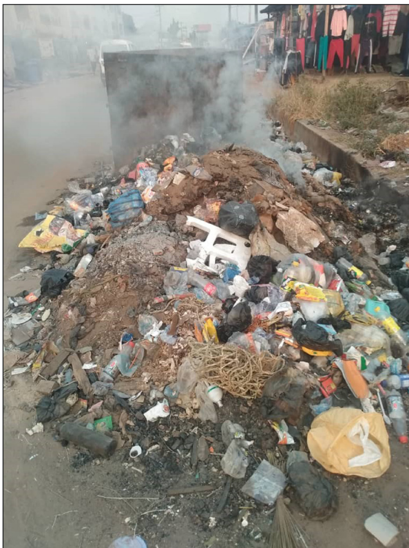
Figure 5: Burning waste in the city.

Here there were no signs of blame apportioned to industry. In a study exploring UK audiences' engagement with plastic pollution, most people saw industry as bearing a degree of responsibility (Henderson & Green 2020). By contrast, the Nigerian students consistently framed the problem as being with consumers: 'it's us'. In their view, once the plastic product had been produced, responsibility shifted immediately from producer to the 'user':