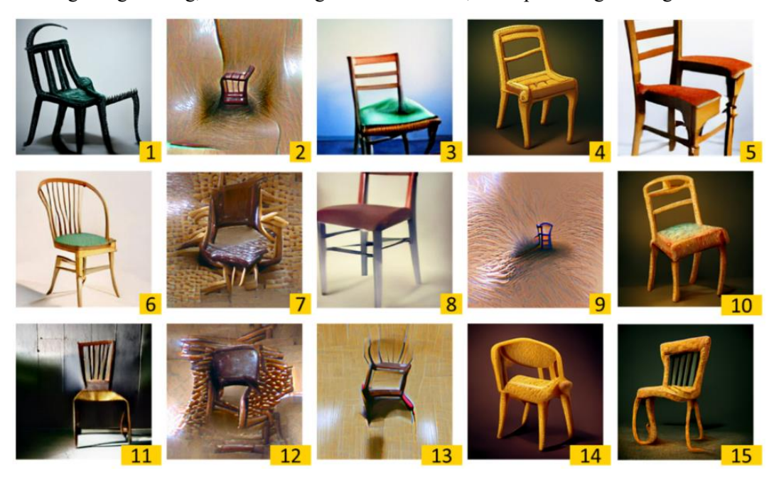
Figure 1 - Worksheet for the experiment with all 15 chair concepts presented.

To better understand the use of publicly available text-to-image AI as a substitute for designers during the conceptual design process and initial exploratory study was devised asking participants, students of the Research Studies class at DMEM, University of Strathclyde, Glasgow, UK, to take part in a concept evaluation experiment. The product chosen for the experiment was a chair based on its simplicity and familiarity. 20 participants took part in the study in six teams (four teams of three participants and two teams of four participants). Participants were 55% male and 45% female of ages between 21 and 24 (Mean 22). Participants were final year (5th year) Masters students studying Product Design Engineering, Product Design and Innovation, and Sports Engineering.