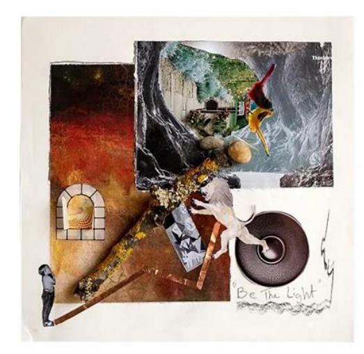
Photographs that capture the vibrancy, colour and outputs of the creative workshops. Click on the images to see them close up!

How creativity can help generate support