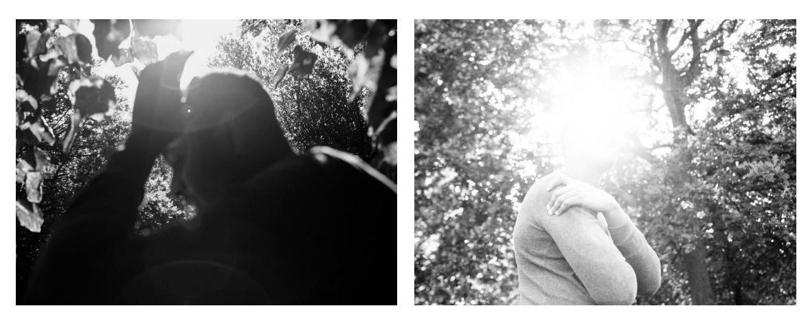
In these two photographs, one of the participants is in his local park in Glasgow – for him, the park is a place where he feels peaceful. It is part of his community, where he can pause, gain encouragement, and connect to the natural world around him.

The image below, reproduced from an online discussion board, shows some of the comments, thoughts and reflections the young people shared.