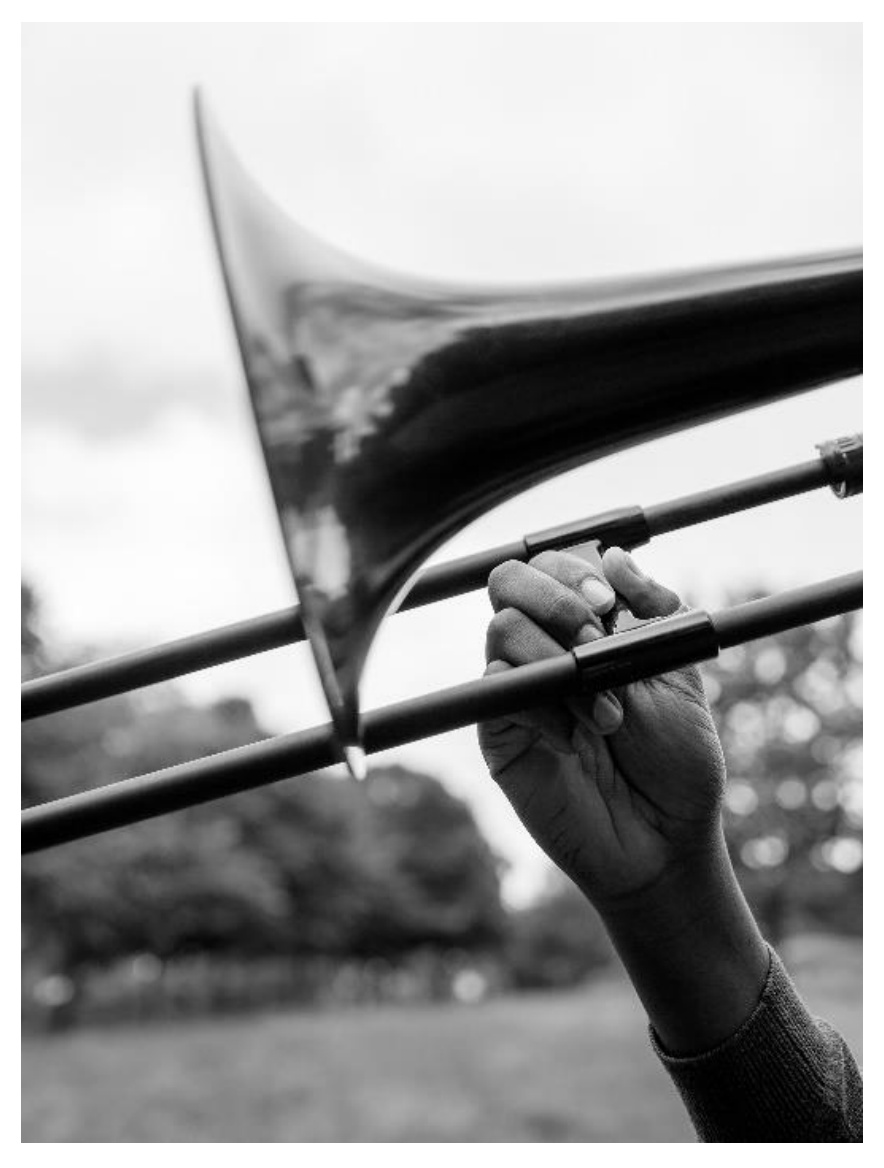
As the participants reconstruct life in a new country, it is important to show how their talents and hard work connect to relational wellbeing. In this photograph, one of the young people shows his commitment to playing the trombone and creating music.

Where young people have been successful in securing permission to settle in their new countries many public authorities fade from their lives and new social networks are built. Ordinary life emerges once again, as they develop sustaining relationships with other people, and add to the life of their new country.