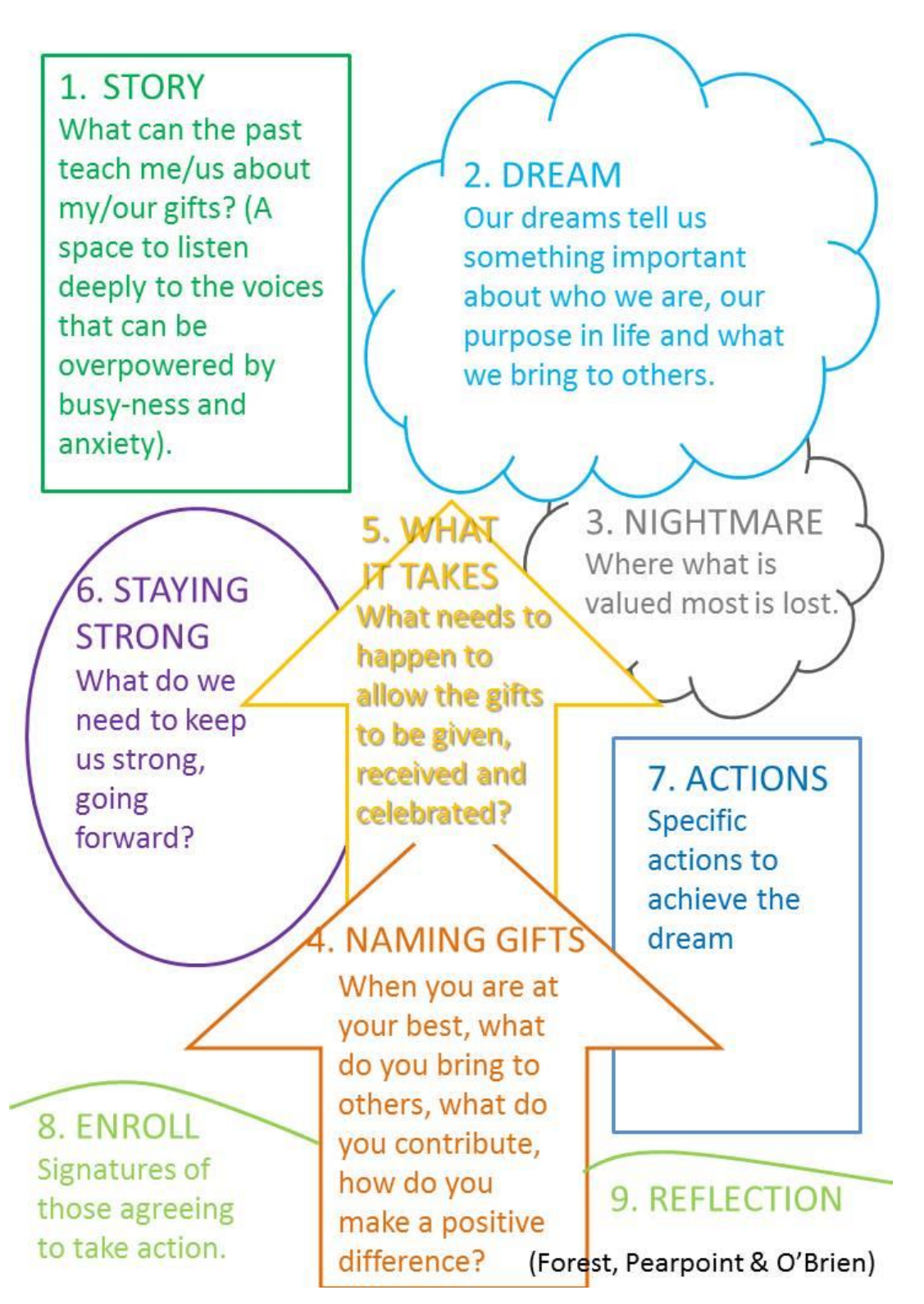
Figure 1. Adapted MAPS template

(Please note that while this template is being shared, it does not capture the full experience of the session which was facilitated by a skilled and experienced psychologist).