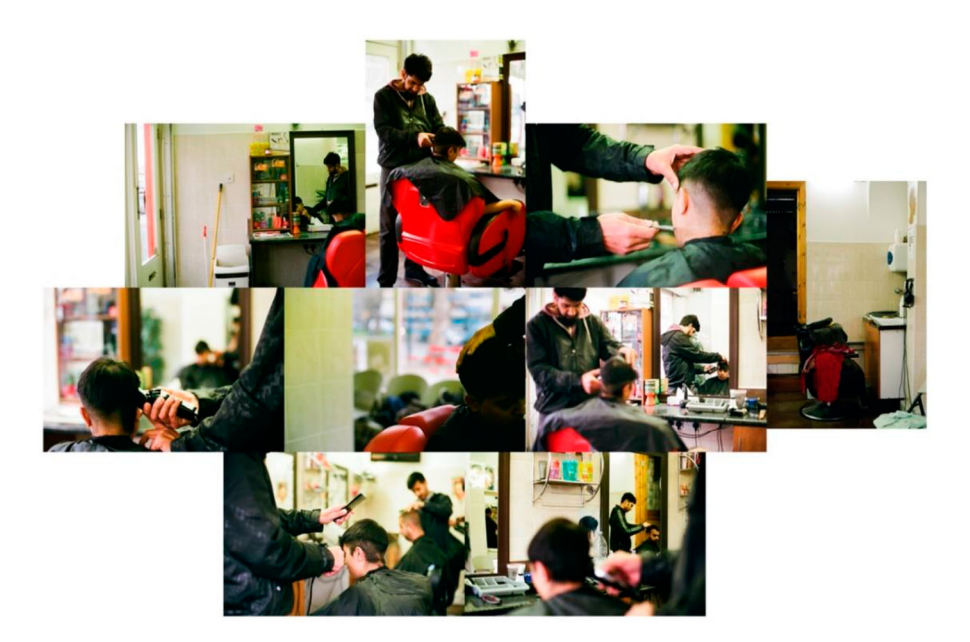
Figure 2. Sita. Artist: Raisa Kabir. Available at: https://www.in-visiblespace.co.uk/photography.

It came out of my need for community and South Asian queerness. I was 22 and was experiencing isolation whilst finishing my BA in Textiles at Chelsea College of Art. I felt that specific kinds of queer South Asian identities at the time were really not very visible in contemporary art practice – I didn't see images of trans, queer, lesbian, bisexual transgendered non-binary people that didn't focus on gay men. Through my art practice I began to question what does a multidimensional queer South Asian identity mean. I felt the world that I was seeing and feeling at the time was not being reflected, and this project was a way for me to engage with my own trauma of being in a predominantly white art institution, being of Bangladeshi South Asian diaspora, with a disability and identifying as a queer femme. (Kabir et al. 2018)