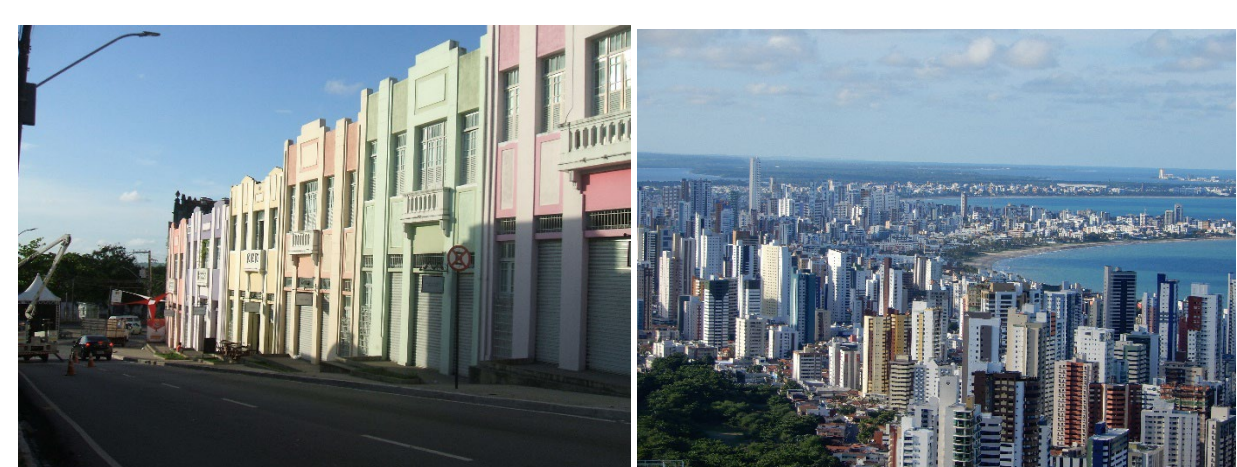
Figure 1 – the historic core