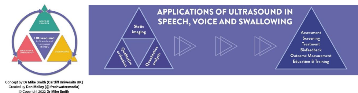
Figure 2: Framework for the use of ultrasound in SLT practice

clinical applications across speech, voice and swallowing. The framework and areas of application in SLT are shown in figure two.