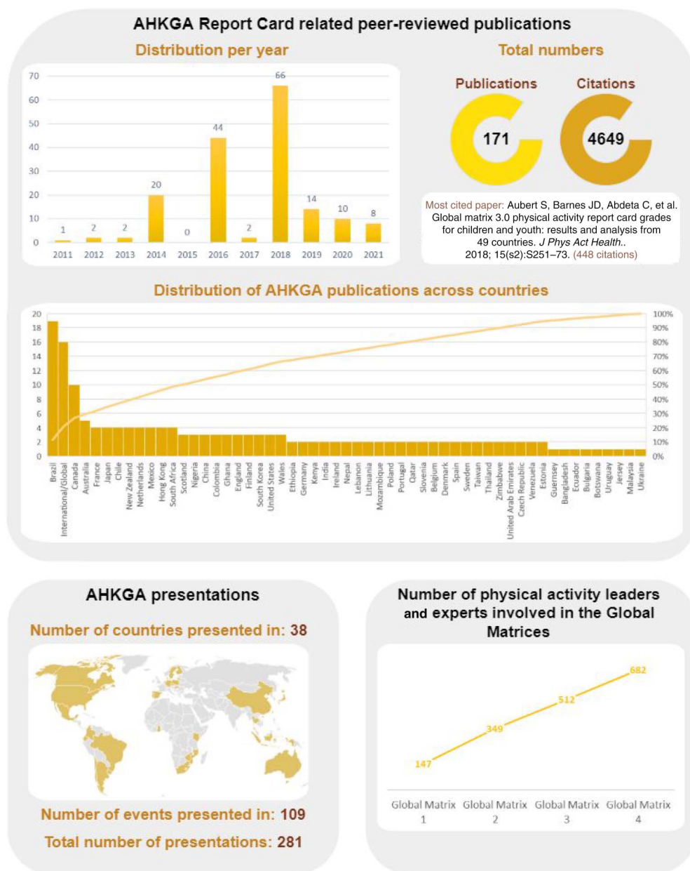
Figure 1 — Infographic summarizing academic outputs from the AHKGA (March 2022). AHKGA indicates Active Healthy Kids Global Alliance.

Index. 19 The decline in participation among low and medium human development countries shown in Figure 3 for the Global Matrix 4.0 may be a manifestation of the inherent challenges of prioritizing physical inactivity among many competing public health issues in these countries, exacerbated by the COVID-19 pandemic amid scarce resources. As an experiment, for the Global Matrix 4.0, we allowed the inclusion of 3 semiautonomous regions within a country to produce report cards in a country that is already developing a national report card (Spain; as well as Basque Country, Extremadura, and Region of Murcia). The successes and limitations of this experiment are described in the accompanying paper by Aubert et al. 7