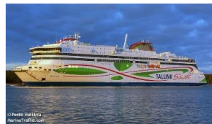
Figure 3. Weather data patterns (Red and blue patterns show the trajectories of passenger and Ro-Pax ships with weather data)

Solvers accounting for the influence of surrounding water in way of contact and evasiveness of relevance to collision and hard grounding accidents (pure racking cases) were thoroughly tested and developed throughout the project. In order to be able to simulate large amounts of accident scenarios as required in risk analyses in a limited computation time, the developed solvers were based on the Super-Element method.