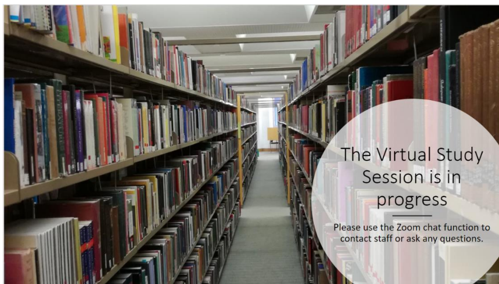
Figure 2 Slide displayed during the VSS

At this point, everyone goes on mute, turns off their cameras and gets on with their work while a slide is displayed of the library to provide that feeling of being 'virtually there'. The participants can use the chat panel if they need support or if they have any enquires for the library staff.