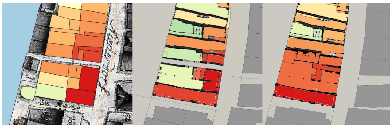
Figure 2. Detail of reconfigurations between 1793 (left), 1950 (middle) and 1990 (right). The densely partitioned merchant row houses were frequently infused with generous, open ground floor spaces joining the accessibility potential of both addresses. In this case, the fusion of three houses and the integration of an alley led to the emergence of a specific type tailored to the exceptional potential of the location.

The first case study investigates the turn-over of a slice of generic, serial tissue along the main artery of the merchant town on the east bank following the construction of a new quayside around 1855 (Abegg et al. 2007: 167-172). The new Limmatquai took over the role of a main north-south throughfare from the former artery, immediately acquiring significantly higher centrality values than the latter. Following subsequent modifications of the global network, the centrality gradient between the two streets increased even further. The fifteen plots in question obtained a second address, providing them with major gains in accessibility. This polarity reversal seems to have initiated a series of transformations affecting both plot pattern and building typology. As a result, the original row of congeneric buildings has given way to a heterogeneous conglomerate, integrating fragments of buildings from various phases in time (Abegg et al. 2007:167).