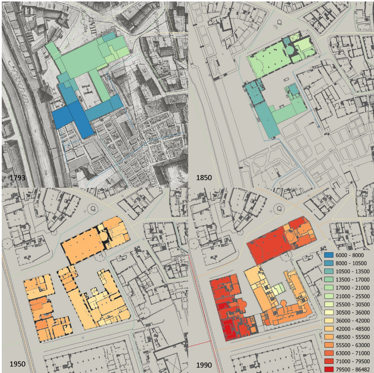
Figure 4. Relative accessibility in terms of the total plot surface reachable from the ground floor spaces of the former Augustinian friary within a radius of 2000 axialmeters at four moments in time: 1793 (top left), 1850 (top right), 1950 (bottom left) and 1990 (bottom right). Values range from blue (<8000m 2 ) to red (>79500m 2 ). Axialmeters is a hybrid distance measure proposed in PST to combine metric walking distance with the number of axial or angular segment steps. It is calculated as the product of the two measures (m*steps).