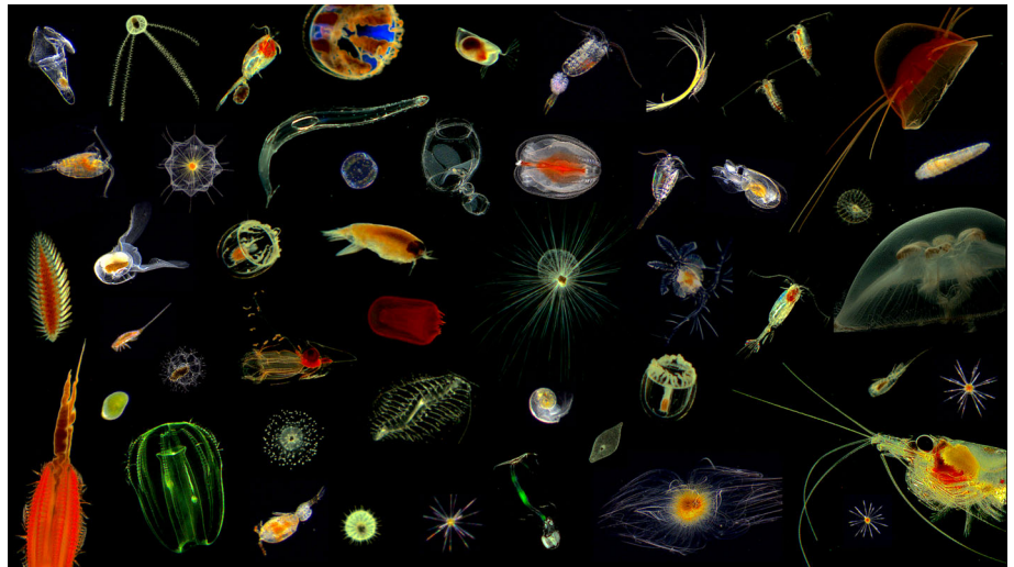
FIG. 1. In situ images of plankton species from the North and South Atlantic.

The Marine Biodiversity Observation Network (MBON; https://geobon.org/bons/thematic-bon/mbon/ , last accessed date: 22 Dec 2021), with the support of the Modelling Different Components of Marine Plankton