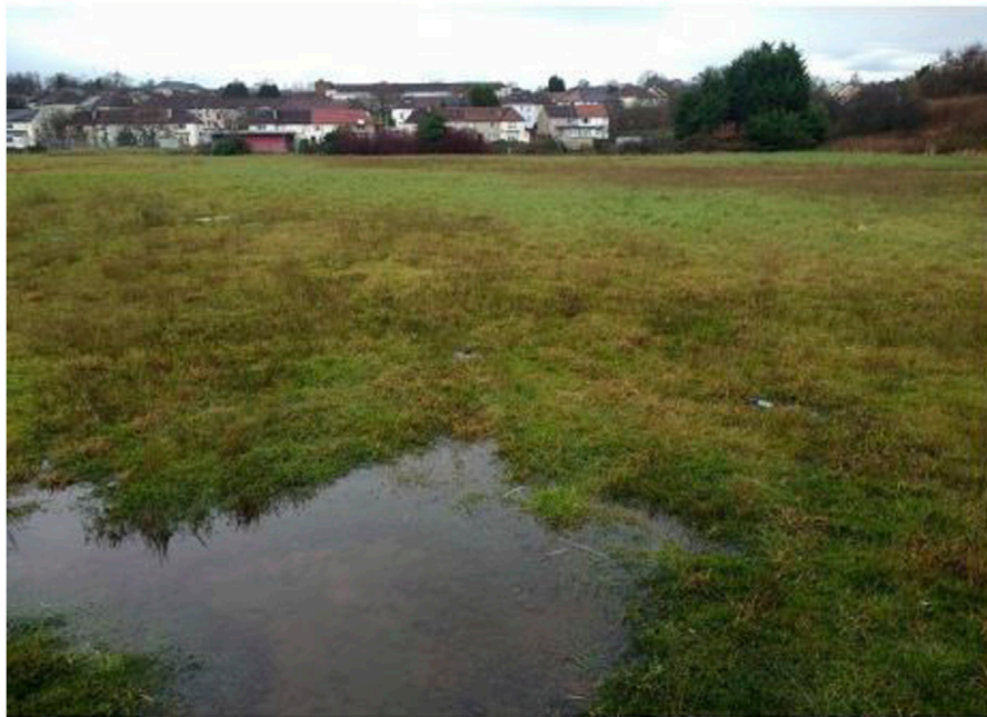
FIGURE 1 | Current land use and water problems of Glasgow park.