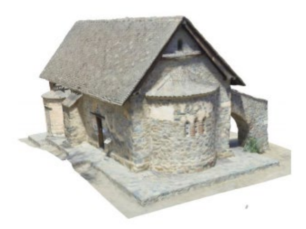
Fig. 5 3D model of Asinou Church (photo from (Themistocleous et al., 2015).

the field (Themistocleous et al. , 2015). In addition, researchers employed a mix of aerial photos to create a 3D model of the cultural heritage site.