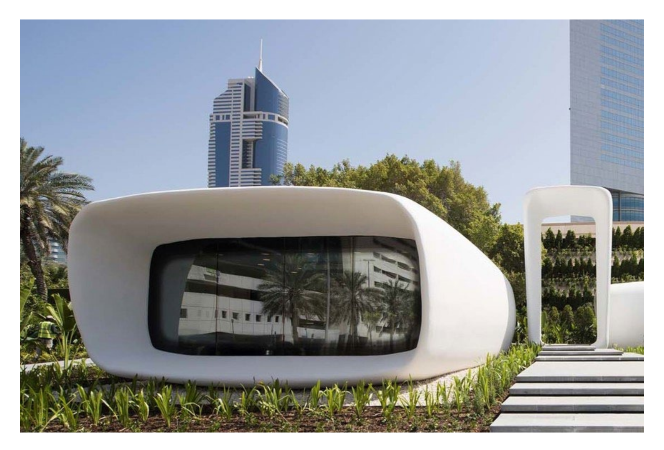
Fig 2. The "Office of the future" in Dubai

The world's first-ever 3D printed hotel room is presented in Lewis Grand Hotel in Angeles City, Pampanga, Philippines (Tablang, 2015). It took over 100 hours to 3D print the 130-square-meter extension. The suite itself is concrete spread, is the world's first legally sanctioned and functioning commercial building constructed using 3D printing technology. Its most recent addition featured 3D printed bedrooms, living spaces, and a jacuzzi area.