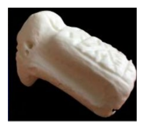
Fig 4. 3D printed replica of the object

An archaeological study of an item was carried out using scientific visualisation and shape analysis tools on 3D digital and physical copies of the artefact. The authors state a few examples of scientific visualisation using 3D models of ancient artefacts for research purposes. In this specific study, aspects such as the object's history and manufacturing processes, handling, and potential usage were explored. The uniqueness of this study is in the systematic procedures used for its 3D documenting, followed by scientific visualisation and shape analysis, which was critically described to create a future framework and methodology for such archaeological artefact study. As a result, the study's findings may serve as a methodological foundation for future archaeological artefact interrogations based on 3D scientific visualisation.