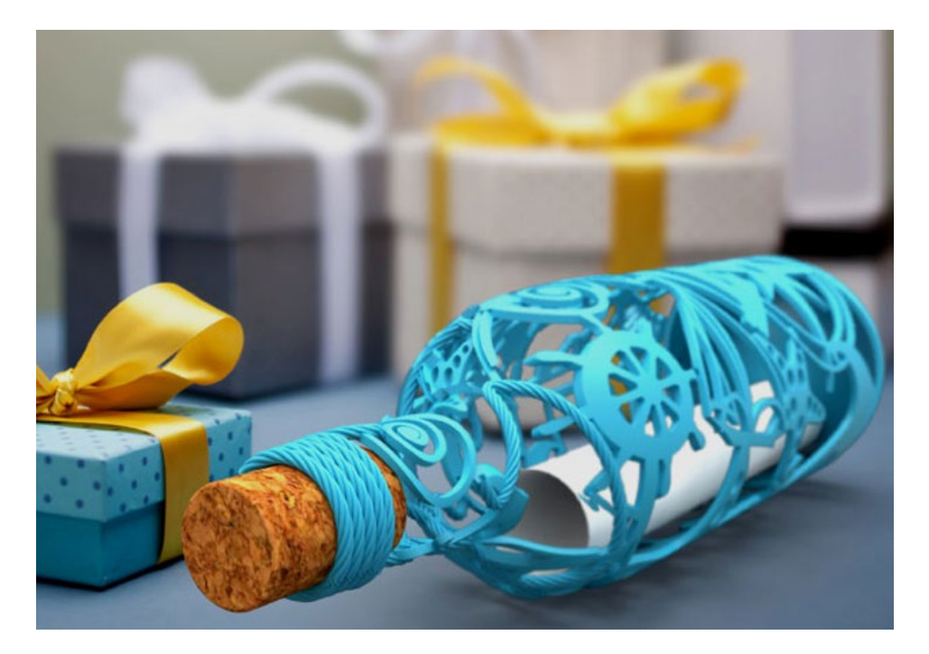
Fig. 7 3D printed message bottle with the paper invitation inside

Another interesting idea that can easily attract more holidaymakers to Cyprus is the 3D printed Wedding invitation. Cyprus is considered a resort island and an island that holds most weddings annually, especially in the high season. This would be an exciting and progressive approach.