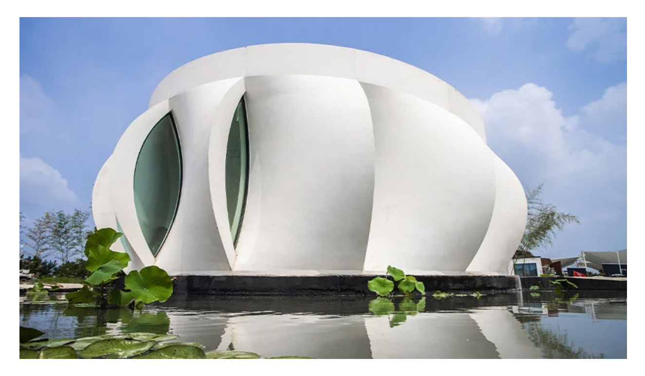
Fig. 1 The lotus house (photo from ("2018 LOTUS HOUSE", n.d.))

Many researchers and firms think that 3D printing may positively impact the building sector, and some large-scale constructions have already been built in many countries worldwide. The project sought to exhibit an innovative, beautiful, and sustainable house by utilising 3D-printing technology in architectural design and construction (Pessoa and Guimarães, 2020).