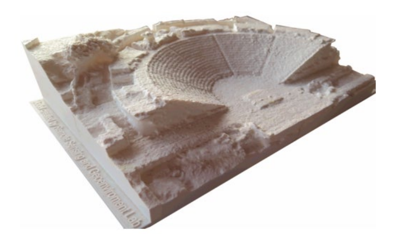
Fig. 6 3D model of a Curium amphitheatre

The research was carried out in Cyprus at the archaeological site of Curium, which is located just outside the contemporary city of Limassol. The peak of Curium, on which the ancient city-kingdom grew, dominates the seashore 4 kilometres southwest of the town of Episkopi in the Lemesos region (Themistocleous et al. , 2016). The city has gone through several stages, including the Hellenistic, Roman, and Christian eras. The area is well-known for its beautiful Greco-Roman theatre (Bowman et al. , 2021; Themistocleous et al. , 2016). The Curium amphitheatre site was chosen, and Ground Control Points (GCPs) were placed around it. At the height of 125 meters, the UAV flew over the location. The pictures were analysed to produce a 3D model, which was then made on a 3D printer.