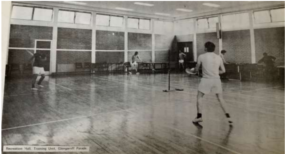
Recreation Hall, Training Unit, Glengarriff Parade