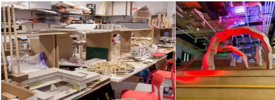
Fig. 1 Illustration of Here East fabrication and making spaces

The course learning is embedded within the London Olympic Park site Here-East equipped with a state-of-the-art fabrication resource including structural, material and