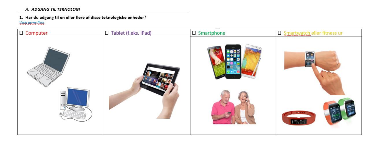
Figure 1. Example of survey questions on technology use among stroke patients.

A neuropsychologist, working as research assistant at Rigshospitalet Glostrup, visited the stroke unit once or twice a week during a period of three months. During these visits, the neuropsychologist approached available patients, informed about the survey and invited them to participate in the study. Participants provided informed consent and completed the questionnaire at bedside with the neuropsychologist reading the questions aloud, correcting any misconceptions, and recording responses on a laptop. If relevant, visual aids were provided to support communication; see example in Fig. 1.