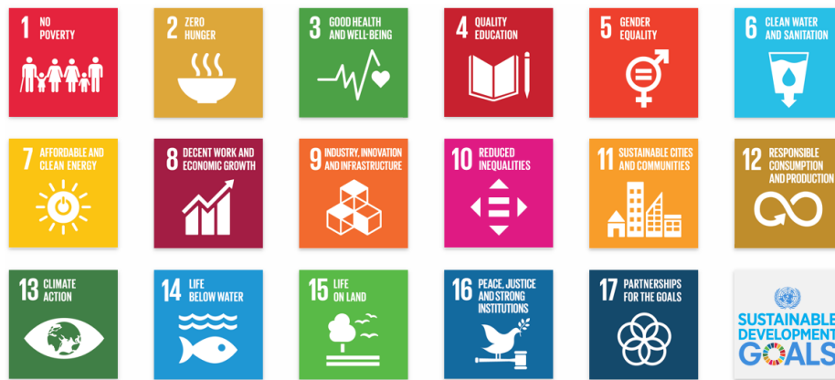
Figure 2: The 17 sustainable development goals (Adapted from United Nations SDG Knowledge Platform, 2020 website)

The SDGs are a shared holistic blueprint for peace and prosperity for people and the planet, now and into the future which stimulates action for transformation to sustainable development. Prior to the development of the SDGs, tools such as Environmental impact assessment (EIA) have contributed towards sustainable development of plans, policy, program, and projects. EIA is usually initiated by a decision to undertake a proposed action. It includes making information available about the environmental consequences of proposed actions and taking account of environmental consequences of the proposed action. Although the concept of EIA was introduced with the passing of the National Environmental protection Act in the United States in 1970, the EIA process has evolved over the decades to address global issues of sustainability and emerging trends, such as cumulative impact assessment, strategic impact assessment of programs and policies, broader coverage of the range of impacts (e.g., social, health, gender, cultural heritage, climate change) and improved public participation in the impact assessment process. In most countries especially in developing economies EIA at the project scale and SEA at national planning scale, are the keys or only available tools for assessment and enhancing sustainable development (Weaver et al. 2008).