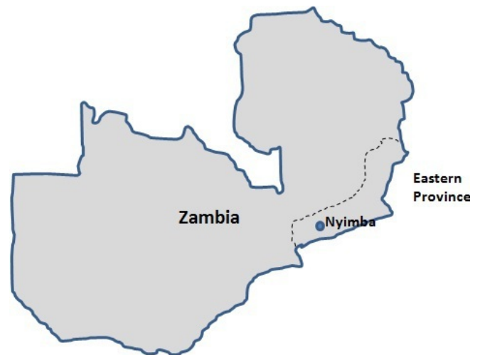
Fig. 1. Location of Zambia's Eastern Province, which borders on Mozambique to the south. Most of our fieldwork took place in the Nyimba district (bottom left).

We also gained many insights through ethnography, participant observation, and informal exchanges during the many unplanned hours in the field, as we waited for lunch to be cooked, visited MSc students, walked through the village looking for a key informant, stopped in neighboring villages to ask for directions, made courtesy visits to local dignitaries, talked to people whom we gave a ride to into town, or moved through the jatropha bushes with some village assistants to find suitable sites to collect soil samples.