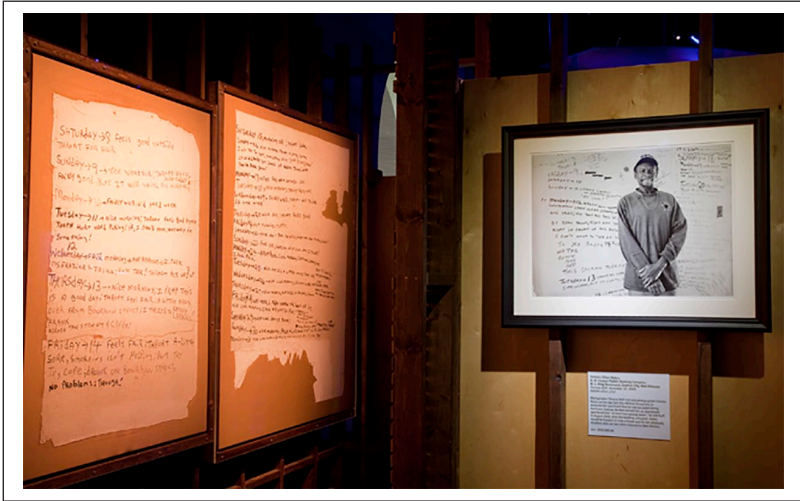
Figure 5. 'Tommie Elton Mabry's Diary', Living with Hurricanes: Katrina and Beyond , Louisiana State Museum, the Presbytère, New Orleans (Authors own image).

encounter with the city. There is a void, a lack understanding, that can never be filled in: 'I've realised that is what I'm doing on this tour. People cannot understand. . . you can't paint a picture, because people. . . they don't realise that water is being churned up like a washing machine. . . they don't realise that houses now have two feet of mud in it. When they were looking for bodies it was months and months afterwards they'd find those bodies' (James). This articulates the limits of personalised narratives – indeed, the limits of language in constructing the traumatic narratives of disaster – and this is foregrounded in the fact that the sharing of the experience is imbued with an individual's emotions and embodied remembrances (Scarles, 2009). James reflected on this and made the following observation: 'actually, this tour was painful. . . I didn't want to do this tour. I really didn't want to do this tour. The reason I did do it is (because) it put me on a bus. It wasn't that I wanted to be doing the tour, but I'd do it well' (James). Similarly, Sylvia shared the intensity of emotion when she visited the Living with Hurricanes exhibition for the first time: 'I don't think half of them (tourists) have seen what this is, but when I went to it [the exhibit] for the first time, I had to leave. I was very emotional, crying. It really just brings back a bad period'.