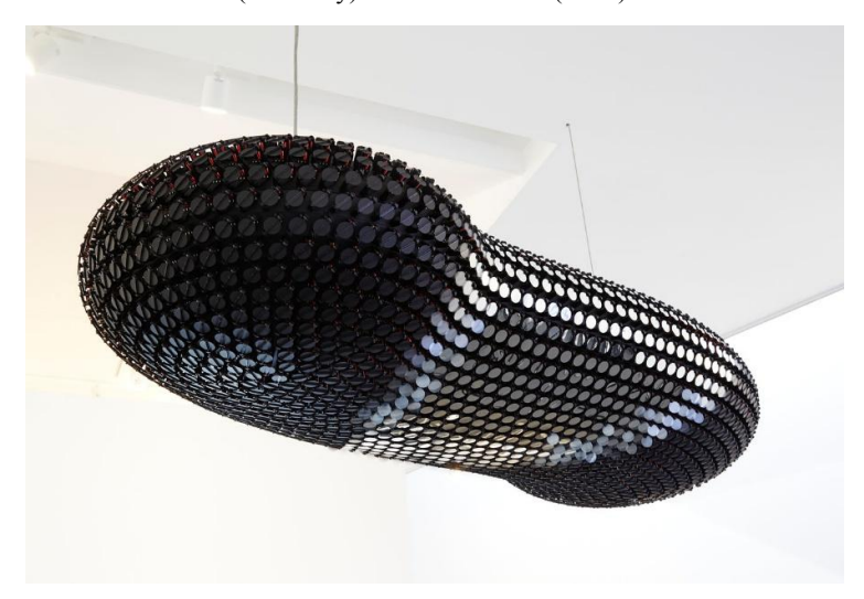
Figure 2. Kinetic sculpture "The Cloud" by Troika at Terminal 5 o Heathrow Airport, London

Many hybrid practices have arisen at the intersection between art and engineering. Many of them have a more artistic lead. This is the case of British studios such as Troika (Figures 1, 2 and 3) and Greyworld, the Paris-based creative collective HeHe and the Japanese offices TeamLab and Rhizomatiks, for example. There are also the longer-established art studios of Olafur Eliasson (Germany) or James Turrell (USA).