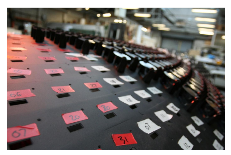
Figure 4. Making of "The Cloud"

But there are also engineers that rediscovered themselves as artists. Moritz Waldemeyer is among them. Waldemeyer started as a tech consultant for the conceptual fashion designer Husseim Chalayan, before launching his own creative practice. These studios usually begin their projects with an artistic approach, to then start a conversation with technicians and scientists to explore what technology allows them to make. This is when projects may take different routes by pulling and pushing between technological possibilities and artistic explorations. In this process, technical companies, whose expertise lays in engineering and fabricating artworks, are often involved.