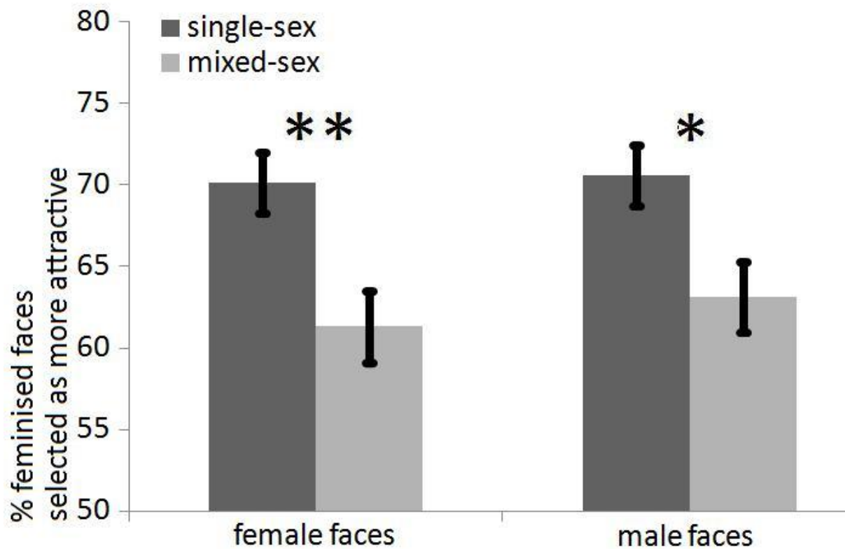
Figure 2. Percentage of times girls at single-sex and mixed-sex schools chose feminised faces as more attractive. Bars = mean \pm SE. ** p < .0 ; * p < .05

judge, girls showed greater preference for femininity if they attended single-sex schools, both when rating male faces ( F_{1,121} = 6.12, p = .015, r = .22 ) and female faces ( F_{1,123} = 8.40, p = .004, r = .25 ) (Figure 2). Boys showed marginally greater preference for masculinity if they attended single-sex schools, but only when rating male faces ( F_{1,111} = 3.67, p = .058, r = .18 ), and not when rating female faces ( F_{1,112} = 1.54, p = .217 ) (Figure 3).