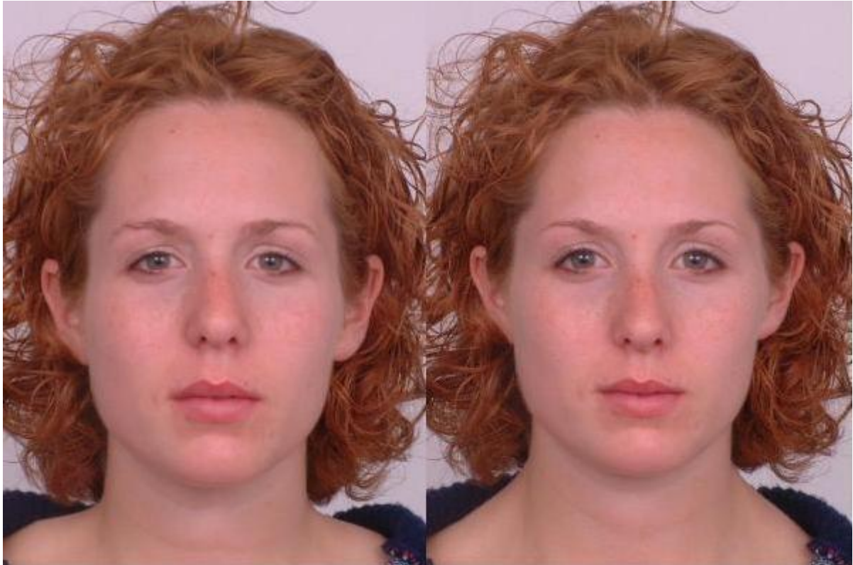
Figure 1. Examples of image manipulation, applied to an adult base face (children's faces not shown for reasons of consent). Face has been masculinised (left) and feminised (right). Image originally published in Saxton et al., in press.