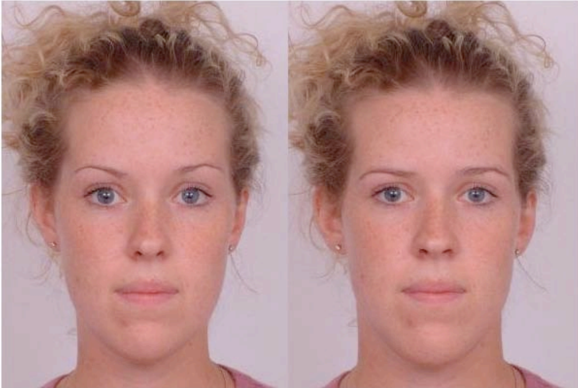
Figure 1. Examples of feminized (left) and masculinized (right) versions of a female face.

studies using these stimuli have demonstrated that the masculinized versions are perceived as more masculine than the feminized versions (e.g., Welling et al., 2007, 2008), confirming that manipulating masculinity using these methods affects perceptions of masculinity in the intended manner. The face stimuli used in the current research have been used in several previous studies (e.g., Jones et al., 2007; Welling et al., 2007, 2008).