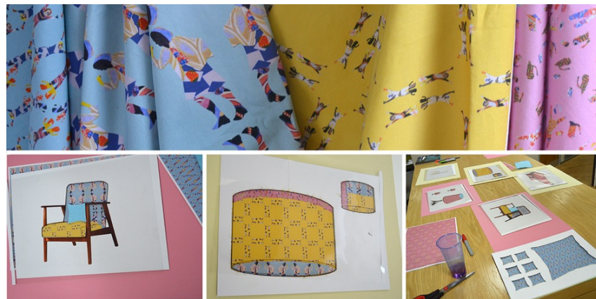
Figure 1. 75BC Textiles and Products

been chosen as they related to the heritage of the Bridgeton area where textile production had historically been a key industry.