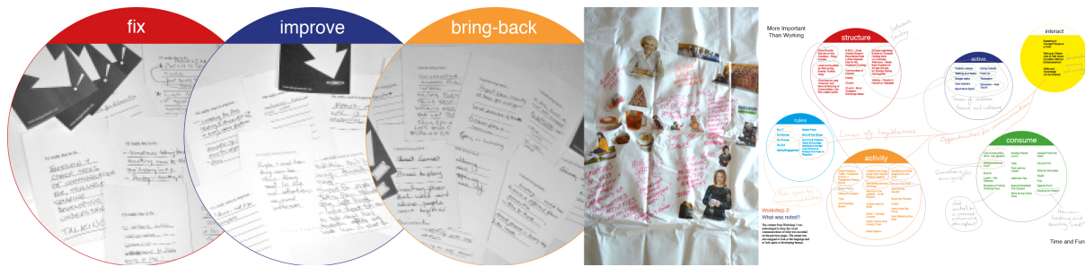
Figure 6. Re-design Sundays Ideas Generation

Personal assertions, affirmation and esteem and identity have been particularly evident in the discussions that have naturally occurred during these group design activities. This has manifested itself in personal insights and revelations that have reinforced the individual's worth within the group dynamic but have also been demonstrated by the decision making, personal choices and collective negotiation that has occurred as the works have evolved. This approach builds upon Fredrickson's (2013) view that emotional responses are key to the mood of people living with dementia and that as emotional responses are one of the last areas to be affected by dementia (James, 2009) that dementia care should start with things that support good feelings and moods. These are best demonstrated by the way in which people personally respond to engage with and make associations through the projects discussed here. Throughout the process the people involved showed enthusiasm to be involved and to share personal insights or narratives that aligned to that which was being explored.