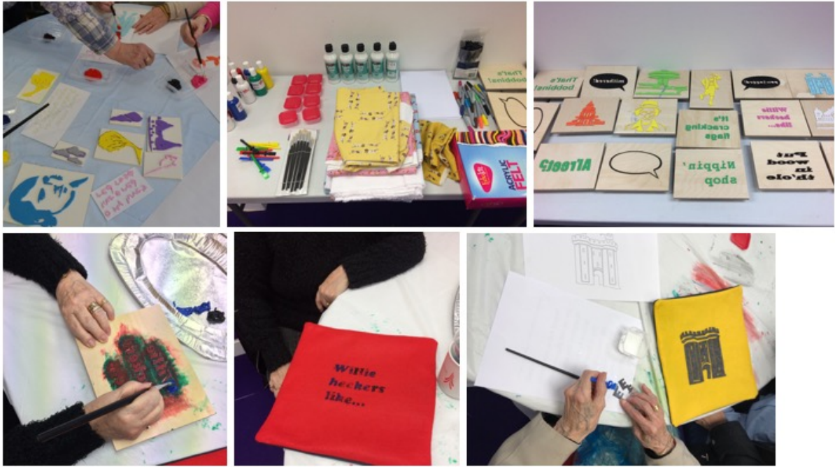
Figure 4. Exhibition kits in development and in use