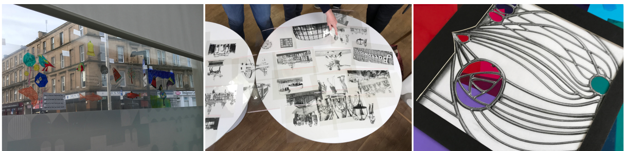
Figure 5. Stained-glass Window development works

The work occurring with Group 2 is in its early stages in regards to this on-going research project. The investigations that they have been developing have centred around excursions to the Scotland Street Museum, Glasgow – paying particular attention to the methods, ideas and processes of Charles Rennie Macintosh, St Mungo’s Museum of Religious Life and work where attention was paid to the stained-glass window displays and discussion of Macintosh’s influence on contemporary stained-glass window designer-makers, and the Kelvingrove Art Gallery and Museum where archives of Glasgow and images of Glaswegian life were explored. The group undertook programmed tasks of making and drawing within these venues to explore various themes that had been discussed and these along with the discussions of what had been seen and done informed group activities to develop in stand-alone workshops. Situated within the group’s regular meeting space these activities were designed around the group set brief to design of a new Stained-glass Window for Glasgow.