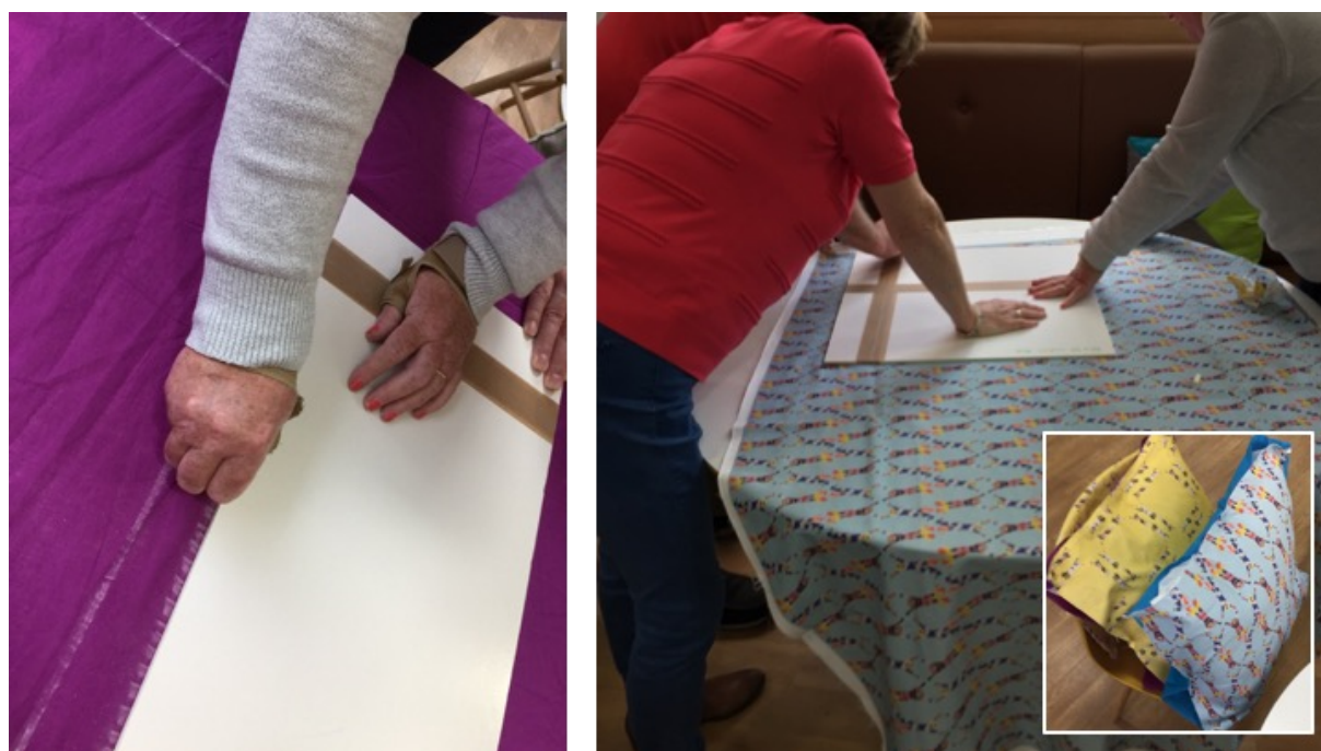
Figure 3. Production of Cushions

On receipt of their new prototype 75BC/Bridgeton textiles, the group reflected upon where and how they might be used. Interior design and fashion formed the key considerations of these discussions. It was decided by the group that the former should be explored as ways to propose applications for their designs. The kinds of objects where textiles play a role listed and a selection of rudimentary objects and forms were chosen. These were then worked into kits which would allow the group members to select surface to apply their chosen textiles to. The result was a selection of rugs, cushions, light-shades, a sofa, a lounge chair, bed linen and wallpaper. Prototypes of some of these objects were created including a set of cushions which have become a key part of the Alzheimer Scotland resource centre in Glasgow. Other prototypes of the fabrics have since been produced in different cotton weights and silks with the intention of exploring avenues for getting these textiles to market.