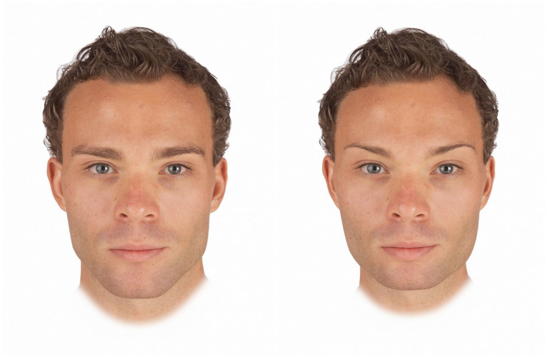
Figure 1. Examples of masculinized (left) and feminized (right) versions of men's faces used to assess facial masculinity preferences in our study.

Each participant completed two face preference tests (one assessing men's attractiveness for a short-term relationship, the other assessing men's attractiveness for a long-term relationship). Trial order within each test was fully randomized and the order in which the two face preference tests were completed was also fully randomized.