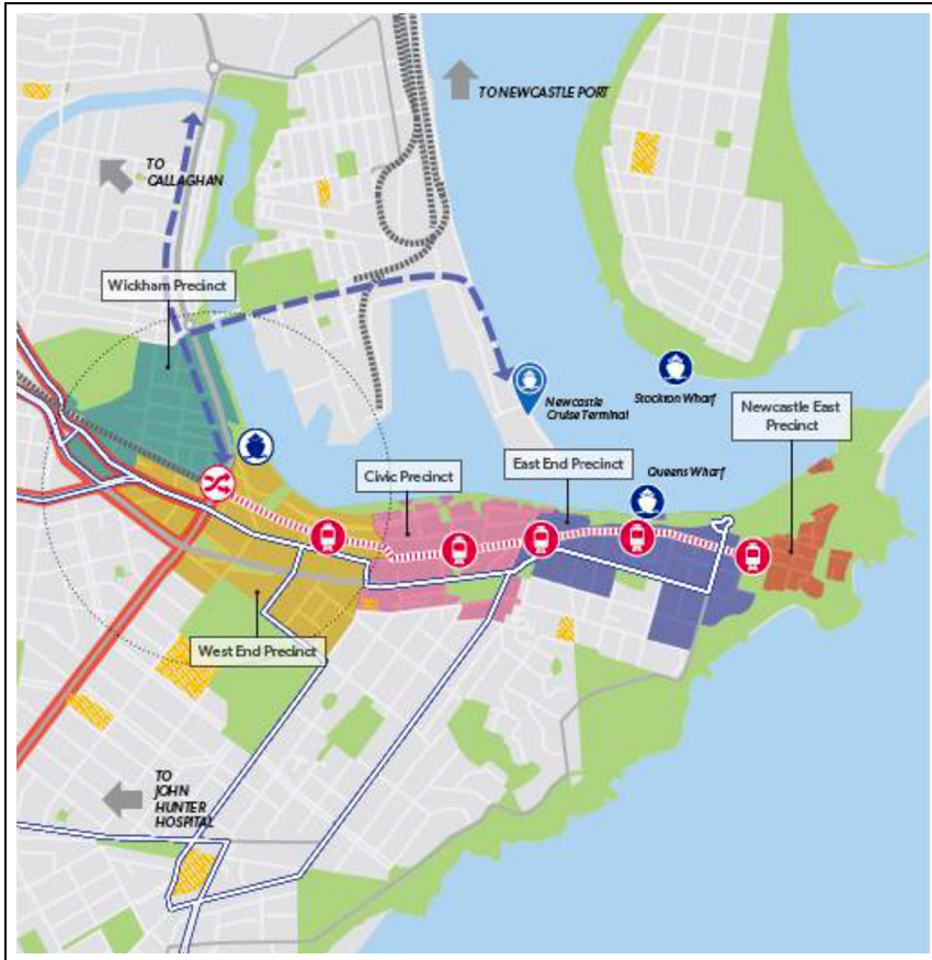
Figure 2. Polycentric linear 'precinct' approach to Newcastle city centre renewal (New South Wales Government, 2018).

similar to that of its namesake in the UK. It too has a vision of a city centre which is entrepreneurial and dynamic, is seen to be globally competitive, offers lifestyles able to attract new populations and has enhanced sustainability credentials through its 'new economy' as a smart city supported by carbon neutral initiatives. It too envisages key roles for the University as a civic partner and in the growth of the student population. It too has a focus on culture as a part of the economic base and a renewed focus on tourism, with densification through infill site residential development. Without any