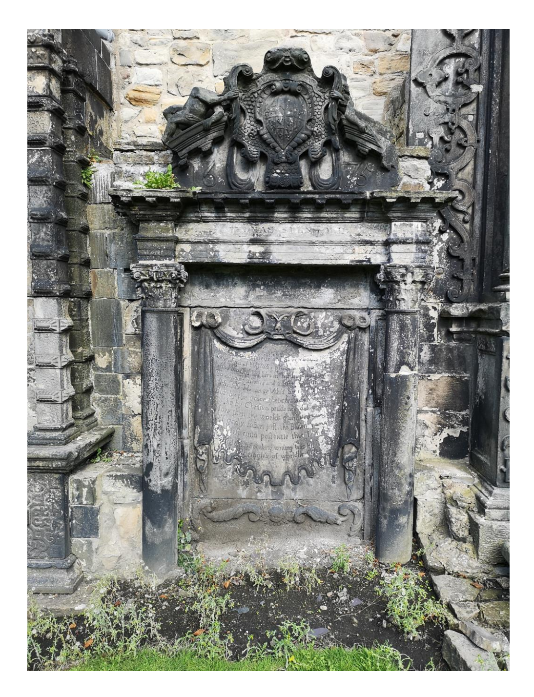
Figure 3: Bethune's monument (Author)