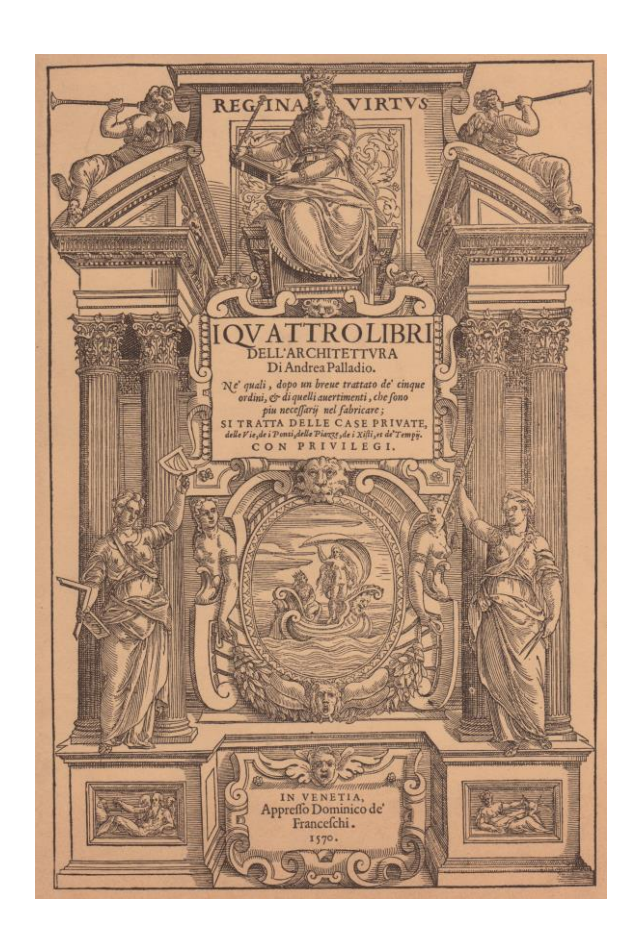
Figure 4: Frontispiece to Palladio's Quattro Libri dell'Architettura . From Palladio, Andrea, I Quattro Libri dell'Architettura . Facsimile of the first edition (1570) with an illustrative note on the life and the work of Palladio by O. Cabiati (Milan: Ulrico Hoepli Editore Libraio, 1990).

As many contemporary individuals of similar social status in Scotland, Bethune's tomb is well designed and executed. The monument's architecture is very different from the rest of the monuments in the East wall (Fig. 1). It presents the form of a gateway and uses classical orders as promoted by the Quattro Libri (Four Books) of Palladio.<sup>26</sup> The overall design of a curved broken pediment refers to the book's frontispiece (Fig. 4).