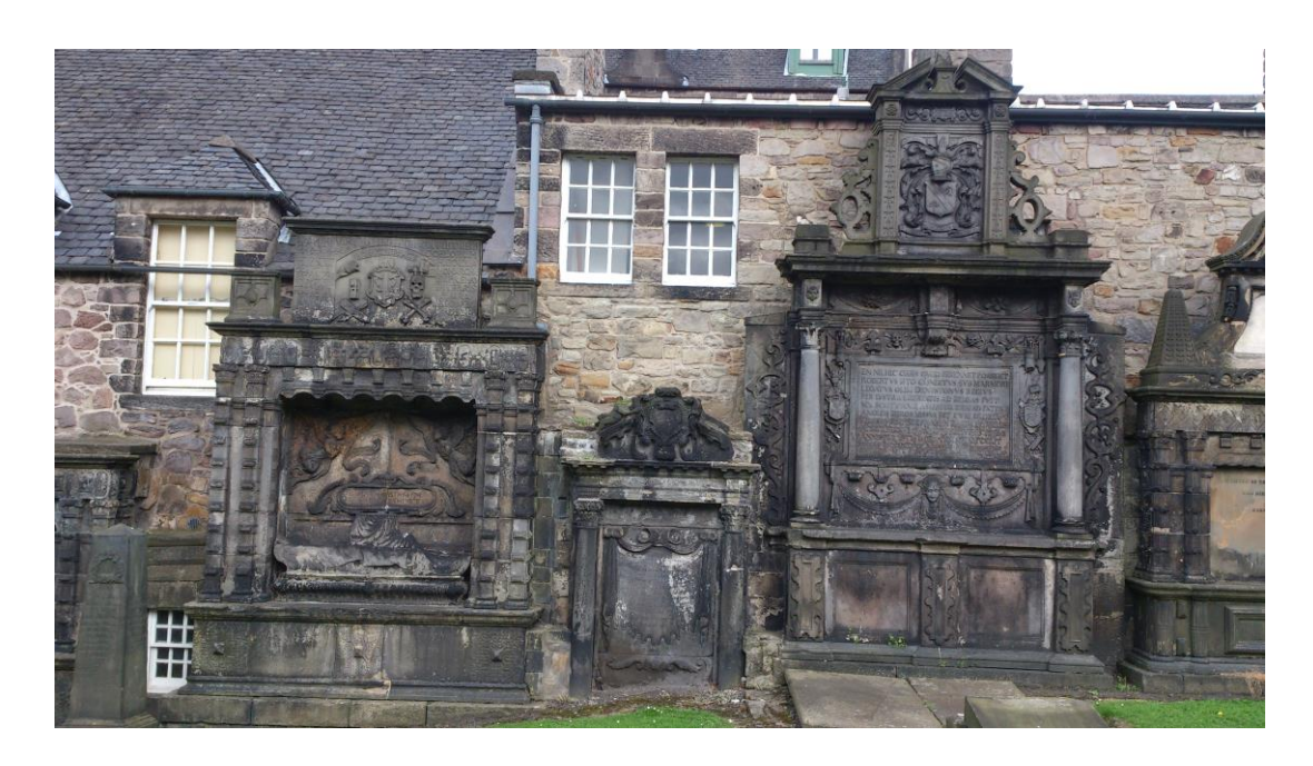
Figure 1: Bethune's monument in its context

north (Fig. 1).<sup>7</sup> Perhaps no other location was available in the churchyard or the East wall was preferred as a matter of tradition and prestige.