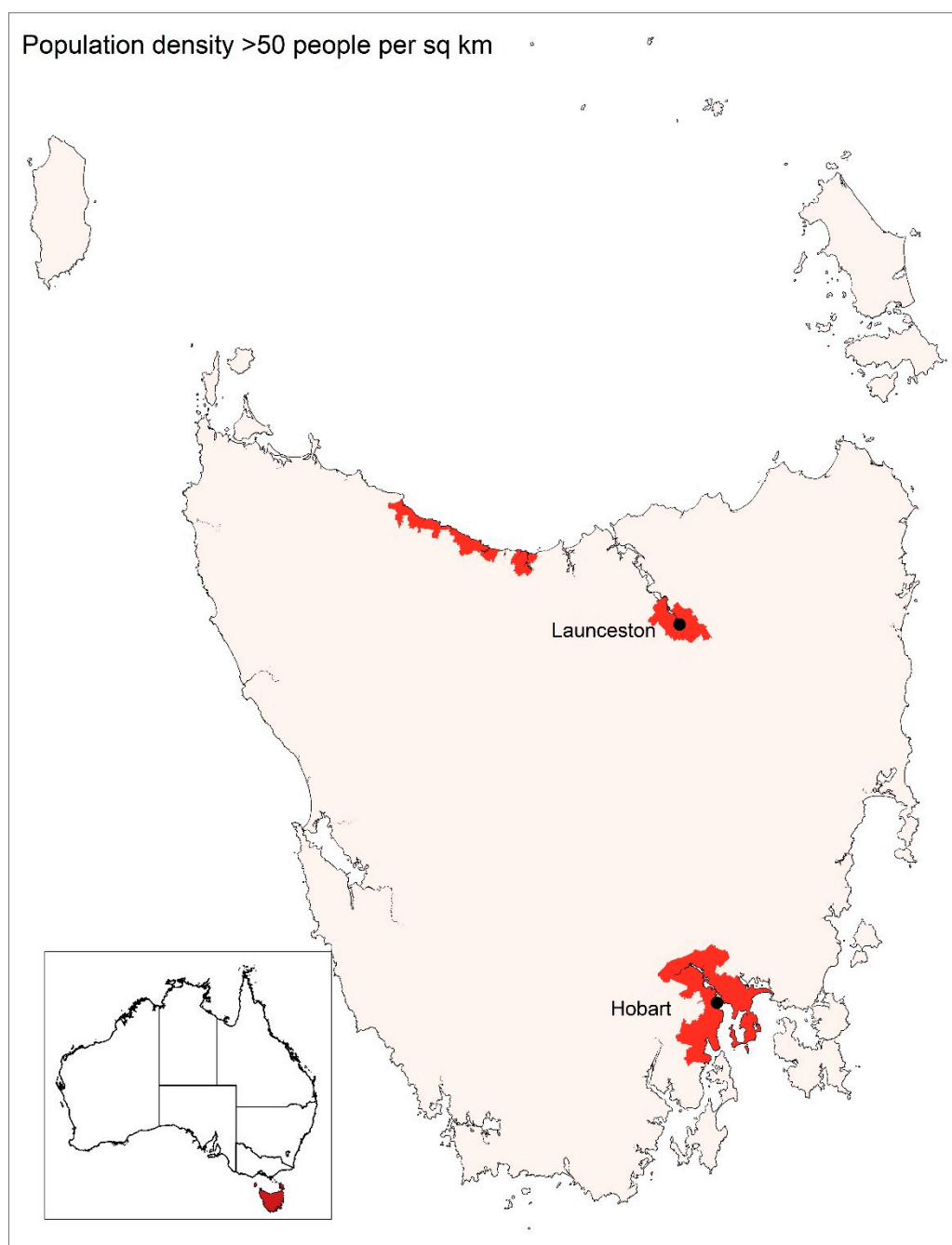
Figure 1. Locations in Tasmania where population density >50 persons per km 2 [26], inset showing location of Tasmania within Australia.

Air pollution data were obtained from the Environment Protection Authority (EPA) of Tasmania's air quality monitoring network, known as Base Line Air Network of EPA Tasmania (BLANKET). New Town station data were used to represent Hobart, and Ti Tree Bend station data were used to represent Launceston. Ambient 24-hour (midnight to midnight) average concentrations of particulate matter with a diameter less than 2.5 \mu\text{m} ( \text{PM}_{2.5} ) readings were used. Where data-points for a 24–48 hour period were missing, the average of a 7-day period, on either side of the missing data-points were interpolated. Where data-points were missing for longer than 48 hours, data were linearly interpolated using the na.approx() function from the 'zoo' package in R [38].