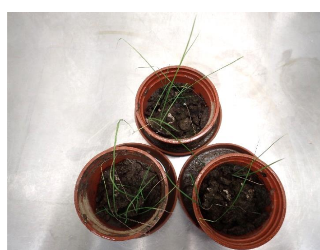
Water treatment sludge 20%

Pot trials using bulk samples taken from the two selected sites and amendments have followed an adapted British Standards (BS/EN 11269-2:2013) method for the effects of PTEs on above ground plant growth. A combination of biological and chemical approaches will be used to analyse the efficacy of the plants and different amendments throughout this study. These will include the use of the modified BCR sequential extraction procedure [3] and single extractants (EDTA and CaCl 2 ) to assess PTE bioavailability, the monitoring of changes in soil properties (OM, pH and CEC) and the measurement of above/below ground biomass after 12 weeks of growth.