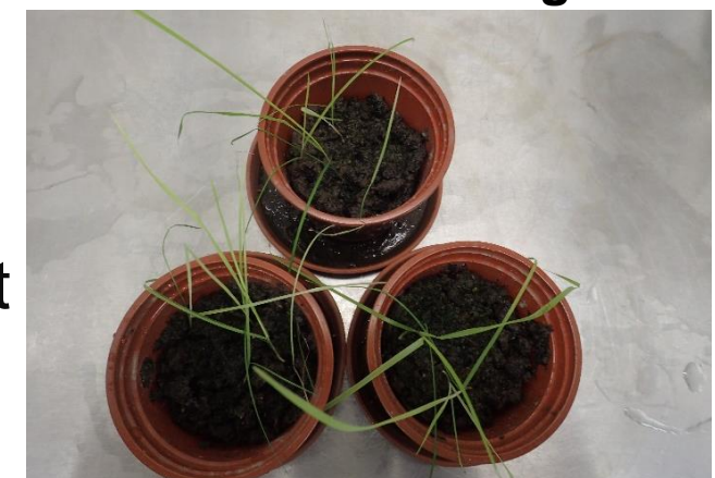
Green waste compost 20%