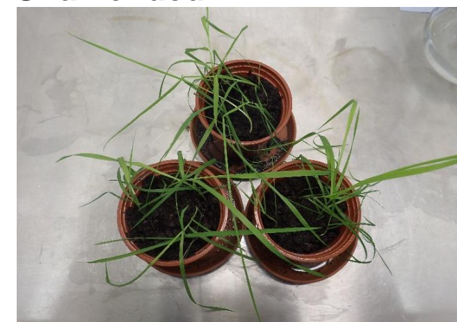
John Innes Compost (Control)