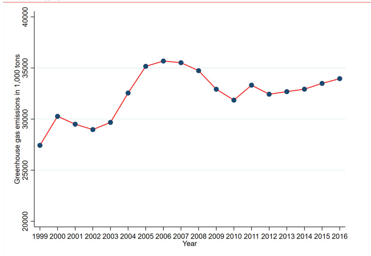
Figure 1. Total greenhouse gas emissions from the UK aviation sector, 1999 – 2016, 000's of tons

greenhouse gas emissions from aviation was roughly 34 million metric tons. On the other hand, the aviation sector's contribution to overall emissions has risen consistently over time in the UK and was nearly 7% of total emissions in 2016 (see Figure 2) 7 . Globally, emissions from the aviation sector are also expected to rise in future years because of the steady growth in international tourism, and it is widely accepted that policy measures are needed to reduce the environmental burden of air travel 8 .