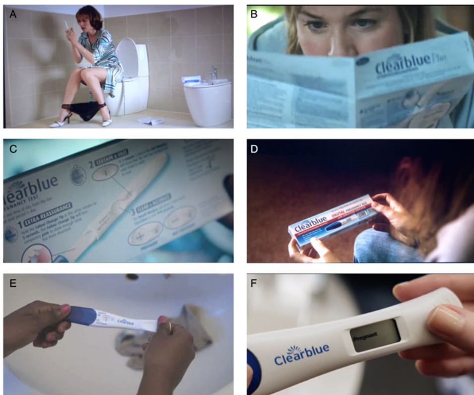
Figure 6. Screen captures from (A) The One and Only (Simon Cellan Jones, 2002), produced by Assassin Films, distributed by Pathé; (B) Bridget Jones: The Edge of Reason (Beeban Kidron, 2004), produced by Little Bird, STUDIOCANAL, Working Title; distributed by Universal and Miramax; (C) Puffball (Nicolas Roeg, 2007), produced by Amérique, Dan Films, Grand Pictures, Tall Stories; distributed by Verve; (D) Albatross (Niall MacCormick, 2011), produced by CinemaNX and Isle of Man Film, distributed by Entertainment One; (E) Love Letter (Lucia Yandoli, 2012), courtesy of Lucia Yandoli; (F) Bridget Jones's Baby (Sharon Maguire, 2016), produced by Miramax, Perfect World, STUDIOCANAL, Universal and Working Title; distributed by Universal.

the Southbank Centre's Tracey Emin retrospective, displayed the artist's used pregnancy tests, now historical artefacts from a 1999 piece. 90 London-based artist Gina Glover's Yes! uses rows of pregnancy tests as tally marks to 'translate the experience of waiting for results during the process of IVF into a stylized, repetitive sentence of images ending in victory'. 91 And Liv Pennington projected extreme close-ups of pregnancy test results 'live in real-time' at performances of Private View (2002–2010) in London,