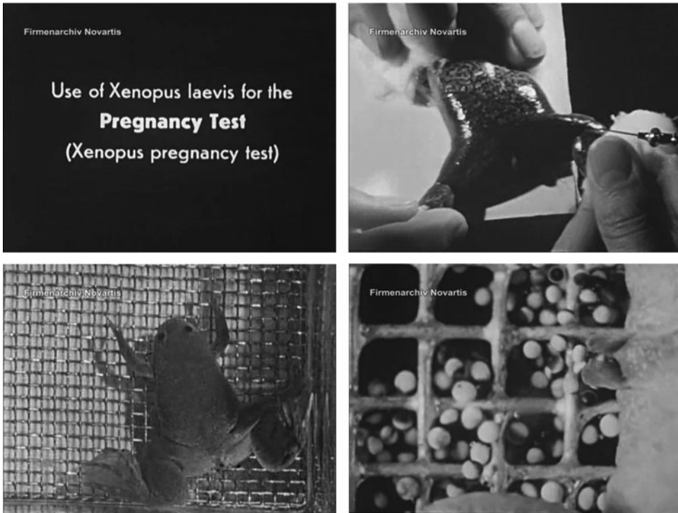
Figure 1. Screen captures from The South African Clawed Toad (Rolf Meier, c.1946) showing (from top left to bottom right): title card, urine injection, test toad and an ‘extremely positive reaction’. The wire mesh, clearly visible in the bottom left image, was used in some laboratories to prevent the toad from ruining the test by devouring her own eggs.

Both films were made for doctors by doctors. The general public remained more or less in the dark about the use of animals in pregnancy testing. 18 Women’s magazines and pregnancy advice manuals occasionally mentioned bioassays in the 1930s and 1940s, but typically discouraged pregnancy testing as an expensive luxury. 19 Only in 1961 did the popular magazine Woman endorse the toad test as a ‘modern scientific achievement’, and then only in response to concerns about Primodos, a controversial pregnancy-test drug that induced uterine bleeding and was suspected of causing miscarriages and birth defects. 20 Medical discretion gave way to open public debate in 1965, when