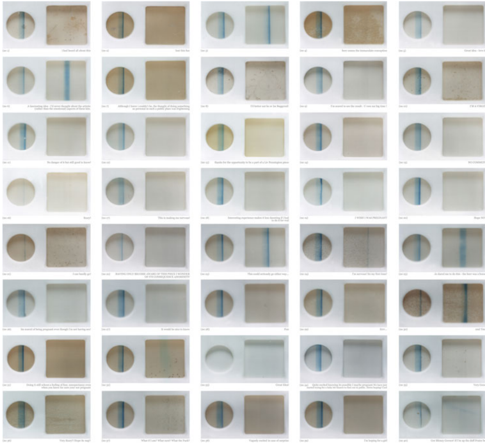
Figure 8. Private View (Liv Pennington, 2006), Digital C type on Aluminium, 80 × 76 cm. Courtesy of Liv Pennington.

media's dual obsession with teenage mothers and older career women trying to conceive; Channel 4's influence on dramatic television and cinema; ITV's restrictive attitude towards advertising; and Unipath's permissive attitude towards placement.