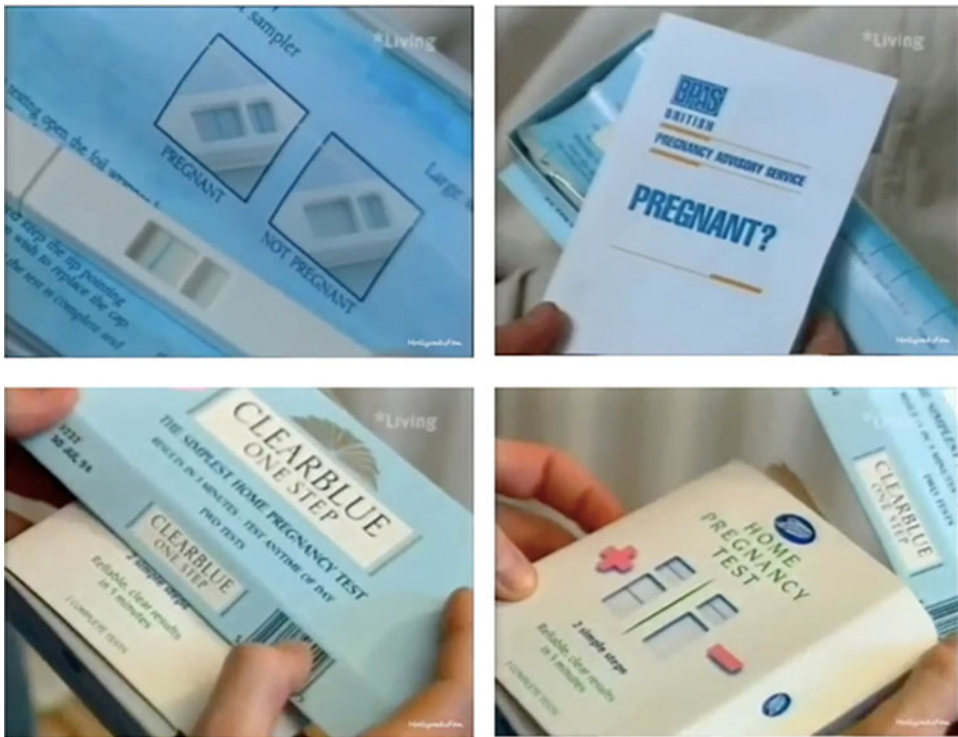
Figure 4. Screen captures from Channel 4's Brookside , first broadcast 14 December 1992, later rebroadcast on Living.