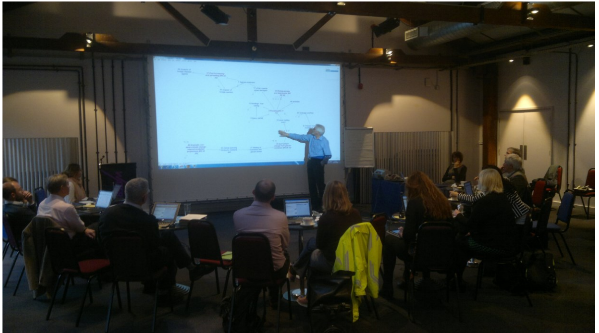
Figure 1: A Group Explorer workshop