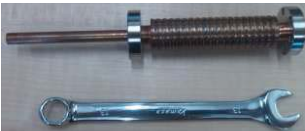
Fig. 4 A photo of the water-cooled electron beam dump.

A water-cooled beam dump to accommodate the higher average power associated with an increased PRF has been designed and optimised through thermal simulations and manufactured (Fig. 4).