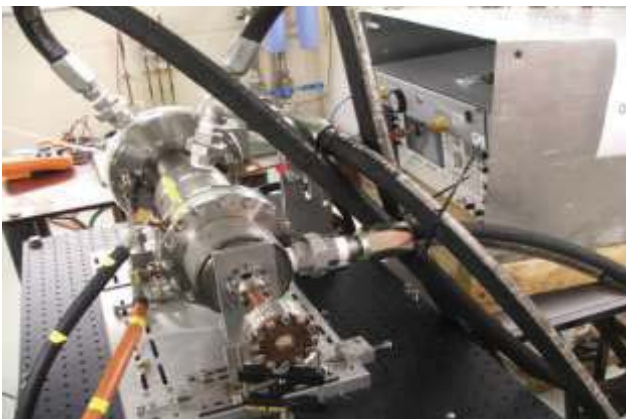
Fig. 1. A photograph of the W-band gyro-TWA experiment.

In the past gyrotron travelling wave amplifiers (gyro-TWA) and gyrotron backward wave oscillators (gyro-BWO) based on helically corrugated interaction regions (HCIR) have achieved unprecedented power-bandwidth performance [1,2]. An existing W-band gyro-TWA (Fig. 1) is being upgraded to achieve an output power of 5 kW with a 3 dB frequency bandwidth of 90-100 GHz and a saturated gain of 40 dB in the University of Strathclyde. For cloud radar application the output of the amplifier is also required to operate at a high pulse repetition frequency (PRF) of 2 kHz when the output microwave has a pulse duration of 380 ns (FWHM).