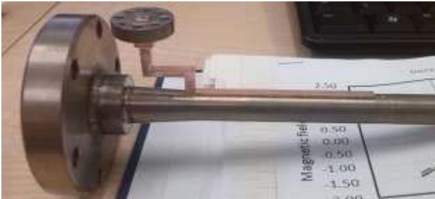
Fig. 3. A photograph of the upgraded input coupler of the W-band gyro-TWA.

The upgraded input coupler (Fig. 3) was improved from its predecessor in three aspects. Its reflection was measured to be 2 dB better, its vacuum leak rate was improved 10 times to 10^{-9} mbar/s and it was mechanically more robust.