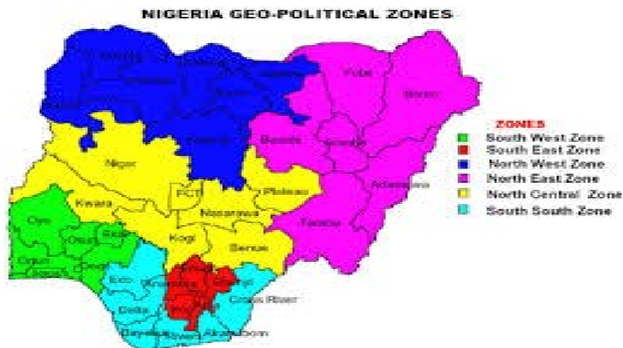
Figure 1 – Geopolitical Zones of Nigeria and Hospitals Taking Part (adapted from (24))

Hospitals taking part: South-West -4; South-East- 1; South-South- 1; North-Central- 4; North-West- 2