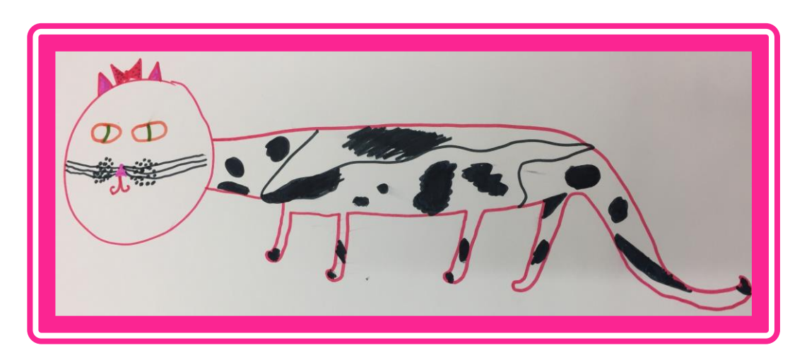
Cat with a Polka Dot Bow, by young research participant. Shared with their permission.