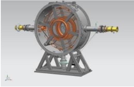
Fig. 2. Cut out view of single cavity module- the cavity body itself is transparent in this view. The central particle apertures and couplers are shown.

The RF cavities were electropolished and HP water rinsed (following SC cavity fabrication procedures) after spinning. In order to tune the cavity frequency, a system consisting of 6 stainless steel forks driven by an actuator system is used to vary the cavity body shape (see Figure 2).