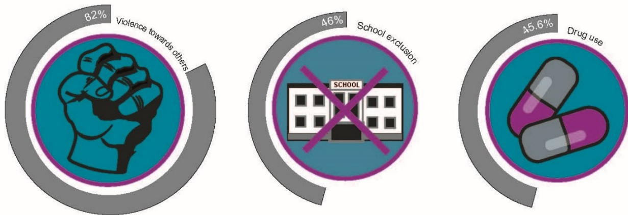
Figure 5: Most common measured outcomes in the sample

The presence of poor outcomes was also a strong feature of the sample, despite their young age. All but three young people had experienced at least one of the six measured outcomes (97.7%), and almost half of the sample (48.5%) had experienced three or more. Violence towards others was the most common outcome, displayed by 82% of the sample, followed by school exclusion (46.0%) and drug use (45.6%).