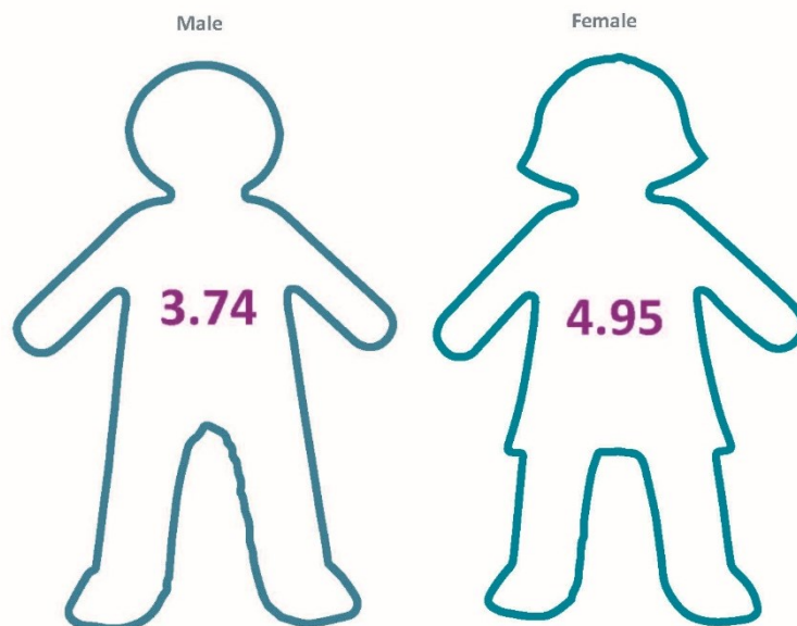
Figure 4: Difference in mean Adverse Childhood Experience exposure between males (n=111) and females (n=19)

Females tended to have a higher rate of exposure to individual Adverse Childhood Experiences, although this only reached significance for sexual abuse, physical abuse, and family incarceration. Males had experienced more exposure to parental separation; mental illness and substance abuse in the family; and bereavement, although differences did not achieve significance (Appendix 1). Females reported a statistically significantly higher composite Adverse Childhood Experience score than males using the ten standard Adverse Childhood Experience categories, with a mean of 4.95 compared to 3.74.