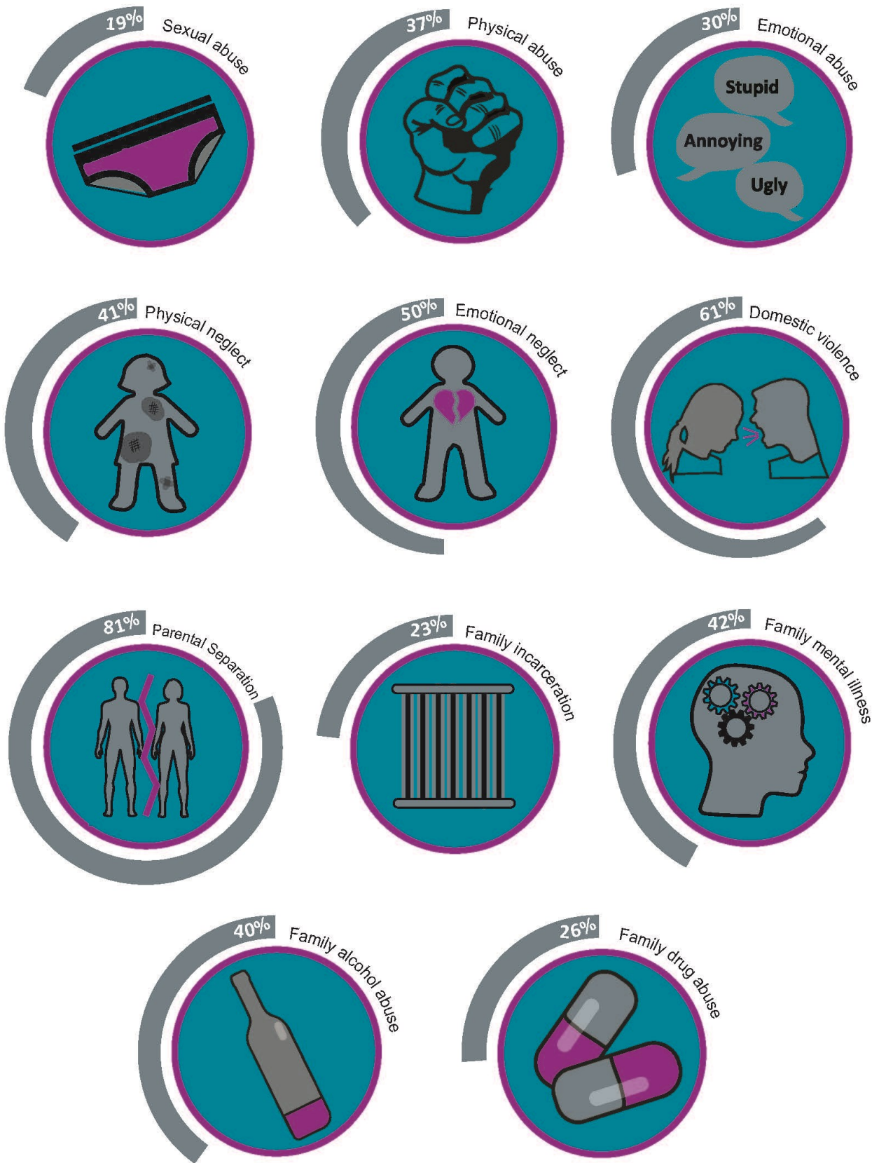
Figure 2: Individual Adverse Childhood Experience Exposure in the IVY sample