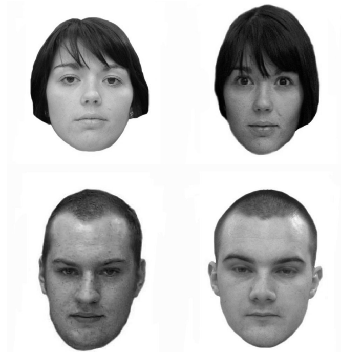
Fig 1. Example trials from the Glasgow Face Matching Test (GFMT). The top pair shows two instances of the same person, the bottom pair shows two different people. The individuals shown in Fig 1 have given written informed consent (as outlined in PLOS consent form) to publish these images.

We carried out three tests of face recognition. 1) The Glasgow Face Matching Test (GFMT) [26] , which is a standardised test of unfamiliar face matching; 2) an unfamiliar face matching test that was designed to be particularly difficult, the Models Face Matching Test (MFMT) [27] ; and 3) the Pixelated Lookalikes Test (PLT)—a new test of familiar face recognition based on very poor quality images.