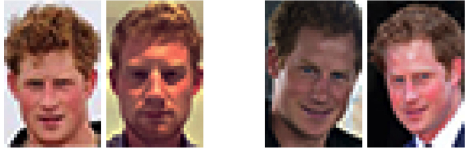
Fig 3. Example trials from the PLT. Images on the left show different identities (with the imposter face on the right). Images on the right show the same identity.