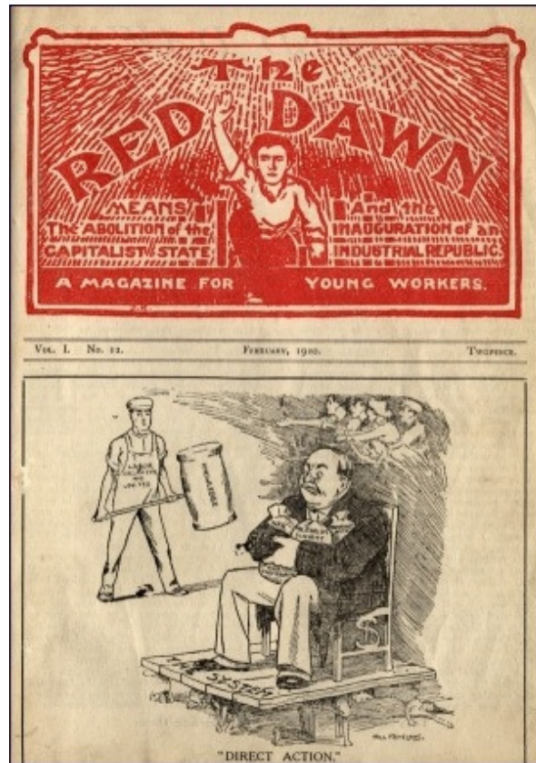
Cover of "The Red Dawn", the official organ of The Proletarian Schools and College, a syndicalist inspired magazine for young workers.

As a project, the GDL ran for two and a half years to the end of July 2002, with the following being amongst its more significant achievements: