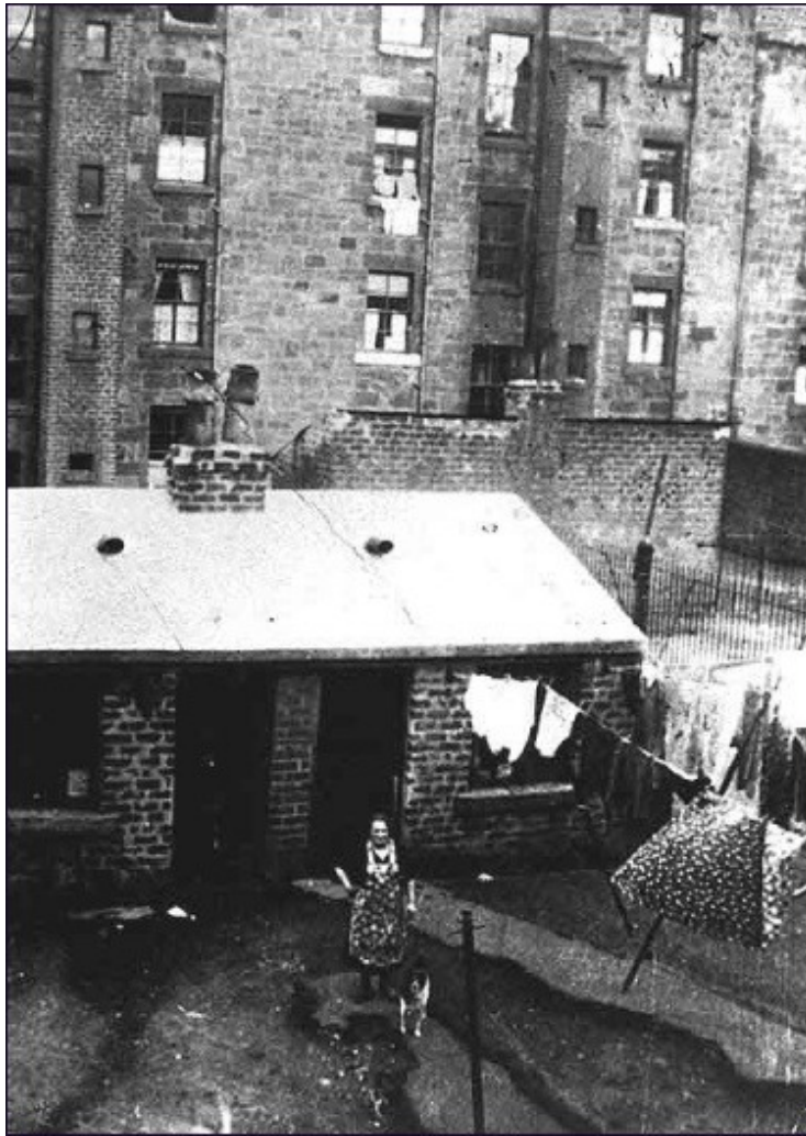
Wash house in back court of Springburn tenements, 1950s