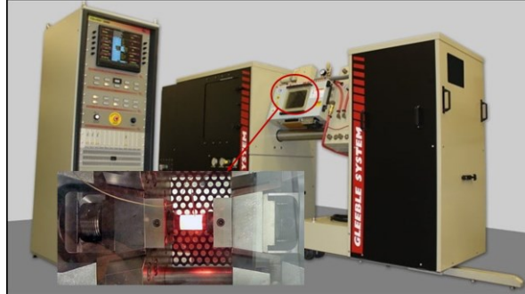
Figure 4 Gleeble 3800 and Position of the die-set with powder inside the machine

At the beginning of the sintering, there was a gap between punches and the die. The gap decreased regularly during the heating time as the temperature increased. During that process it can be clearly noted that the gap gone during the temperature holding period which shows an ideal flow of the electrical current.