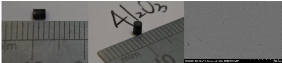
Figure 5 . A formed sample (solid cylinder) with a size of \Phi 2.0mm \times 2.0mm and its SEM micrograph

Figure 4 shows The morphology of a formed sample #5, and it is very good and strong sample and it not easy to be break. The dies were designed to have a samples with dimension \Phi 4.0mm \times 4.0mm and \Phi 2.0mm \times 2.0mm, and the samples formed were found to have similar dimensions. Moreover, the microstructure of the formed sample #5 in Figure 4 shows a good surface, but there were some small pores. And no obvious large pores were observed.