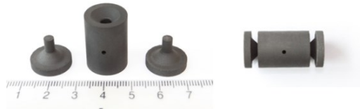
Figure 1 Graphite Punch and Die set

hole has been set in the middle section of the die, in order to measure the temperature using the thermocouple.