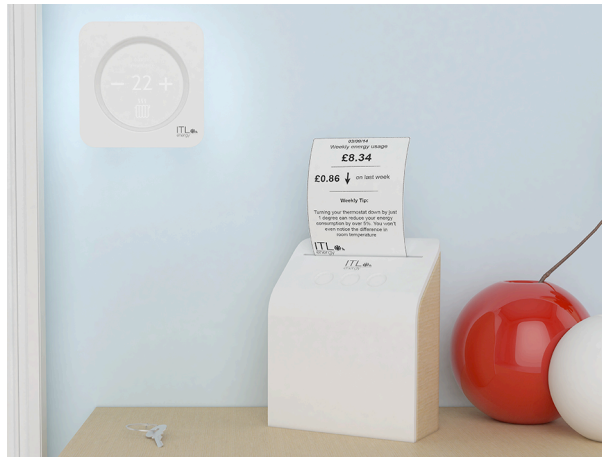
Figure 1. Concept 1: Participants particularly liked the uncluttered user interfaces.

dementia, speculated that the simpler design might be more appropriate for people with mild cognitive impairment, based on lived experience of her partner not understanding their home energy monitor because it is too complex. It was suggested that the simpler design might be more accessible to children who, as family members, are also responsible for their consumption behaviour, and that the print outs could be filed with other energy and gas utilities documents. One participant commented ‘That would be a good way to stop them diddling you!’